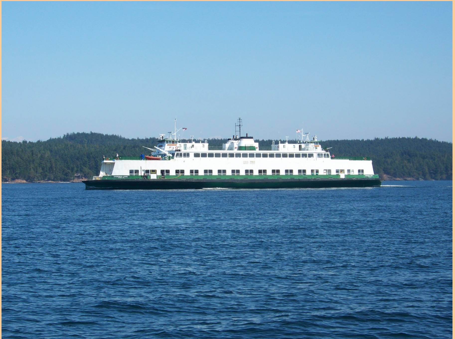
Washington State Ferry