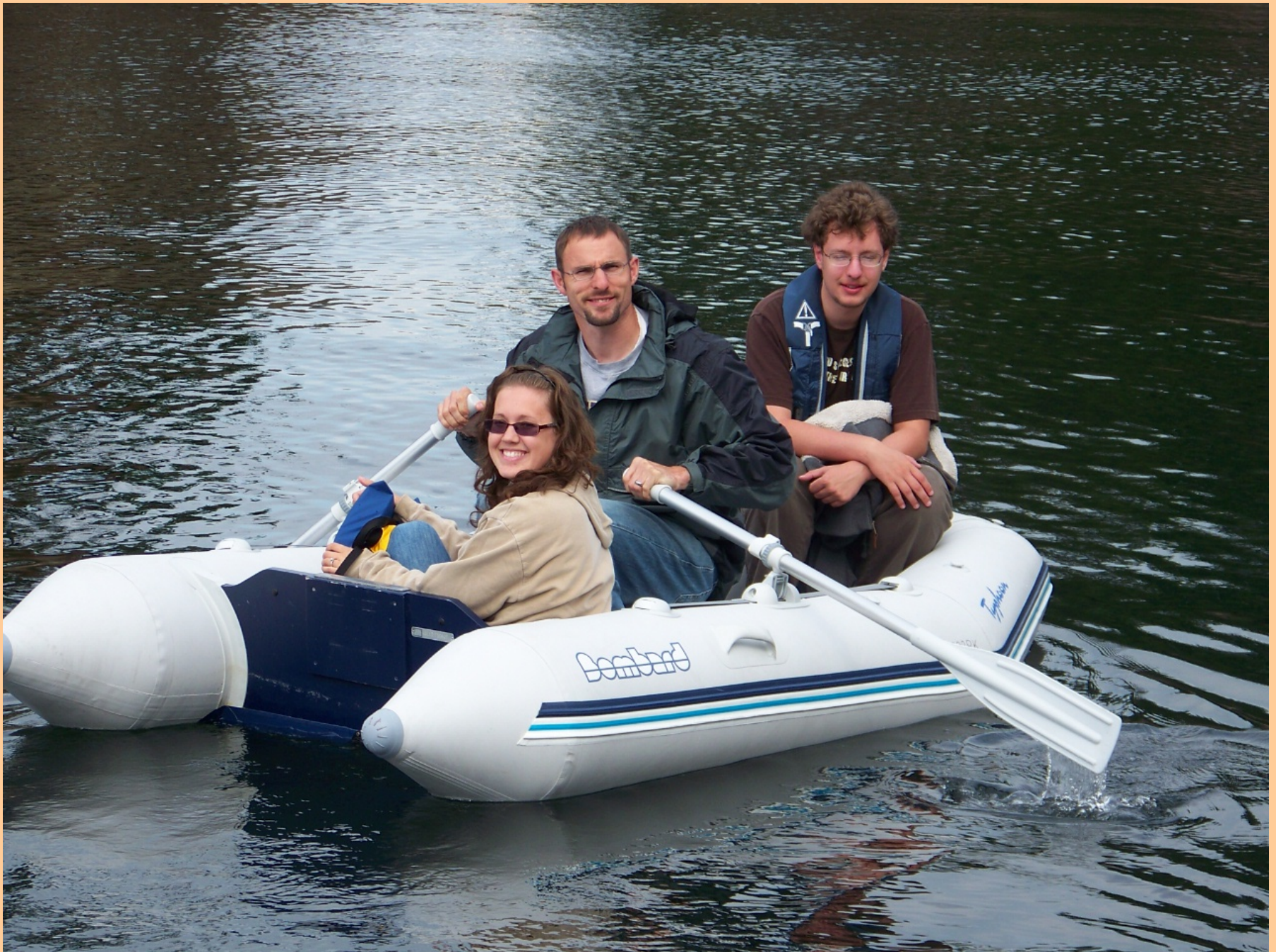
The Crew at Matia (May-shuh)