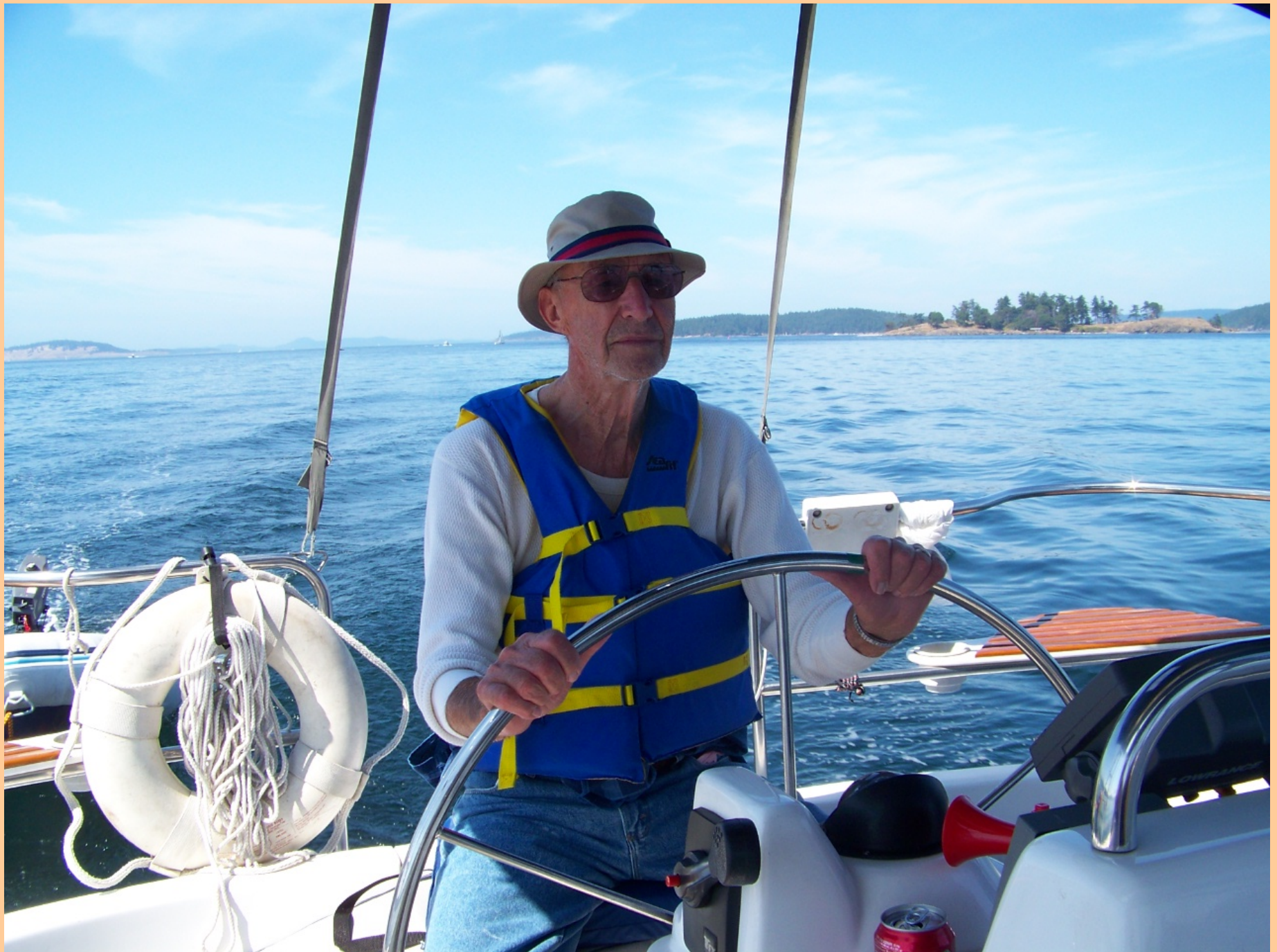
On the Way to Friday Harbor