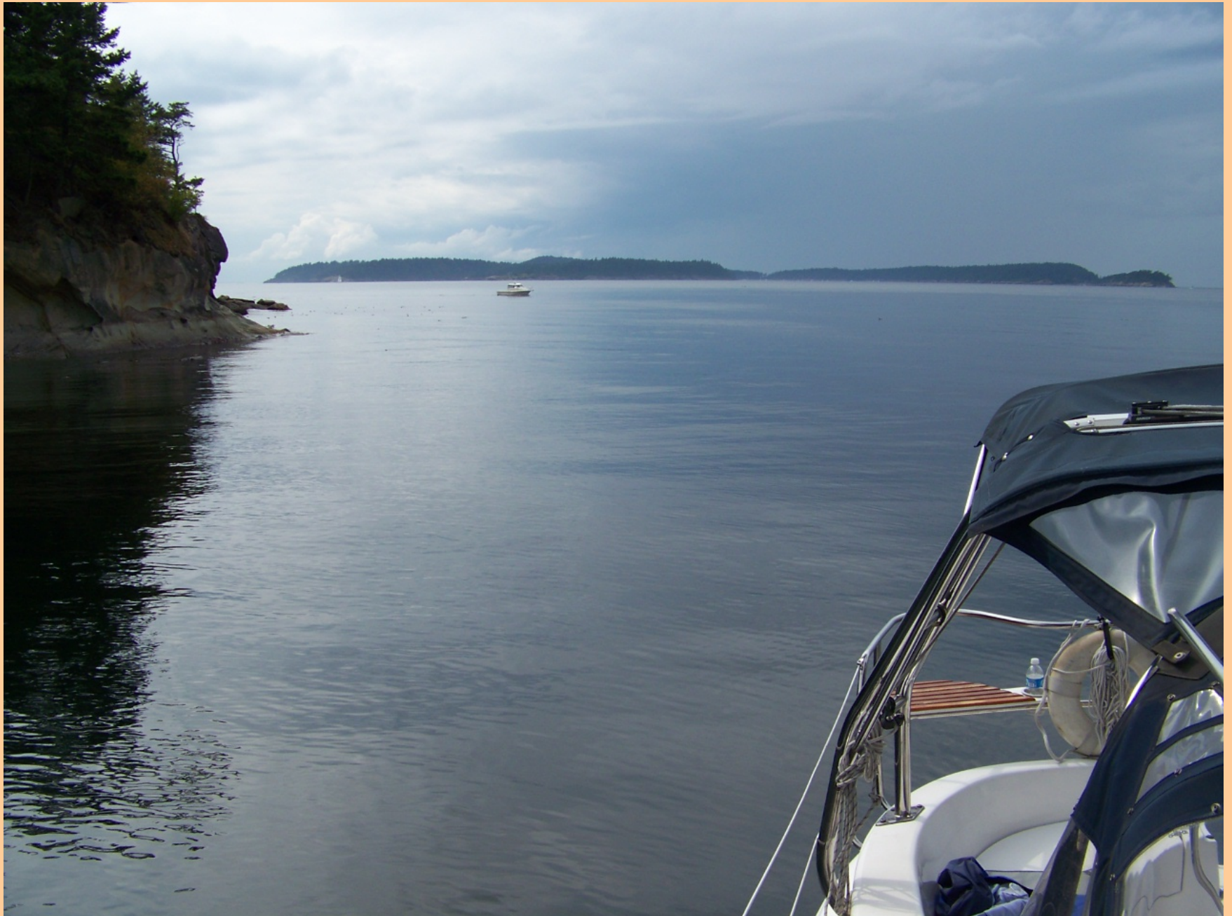
Crossing to Sucia (Soo-shuh)