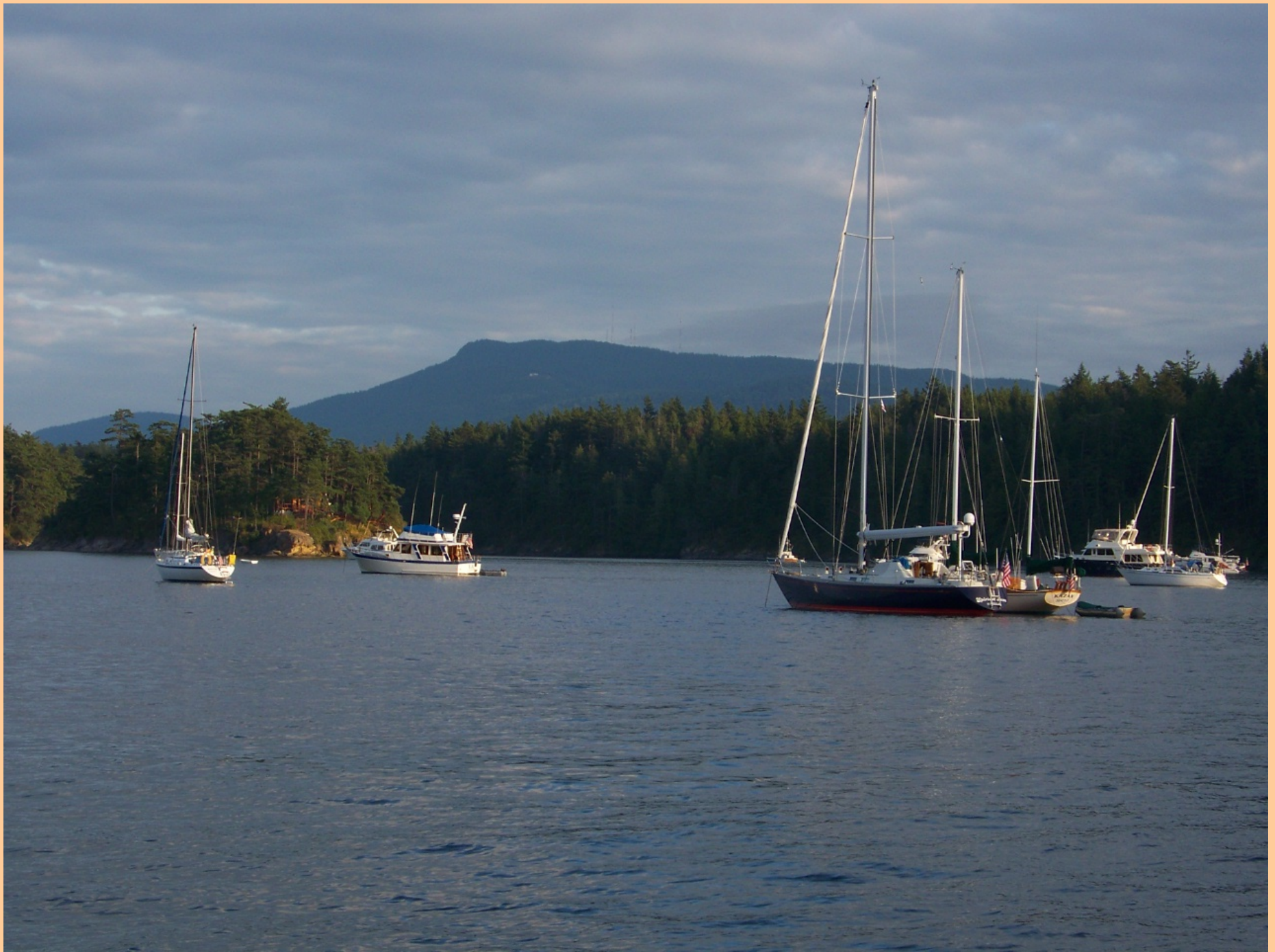
Echo Bay on Sucia