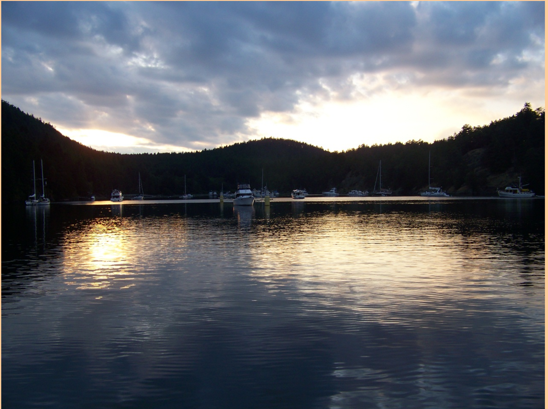
Stuart Island Harbor at Sunset