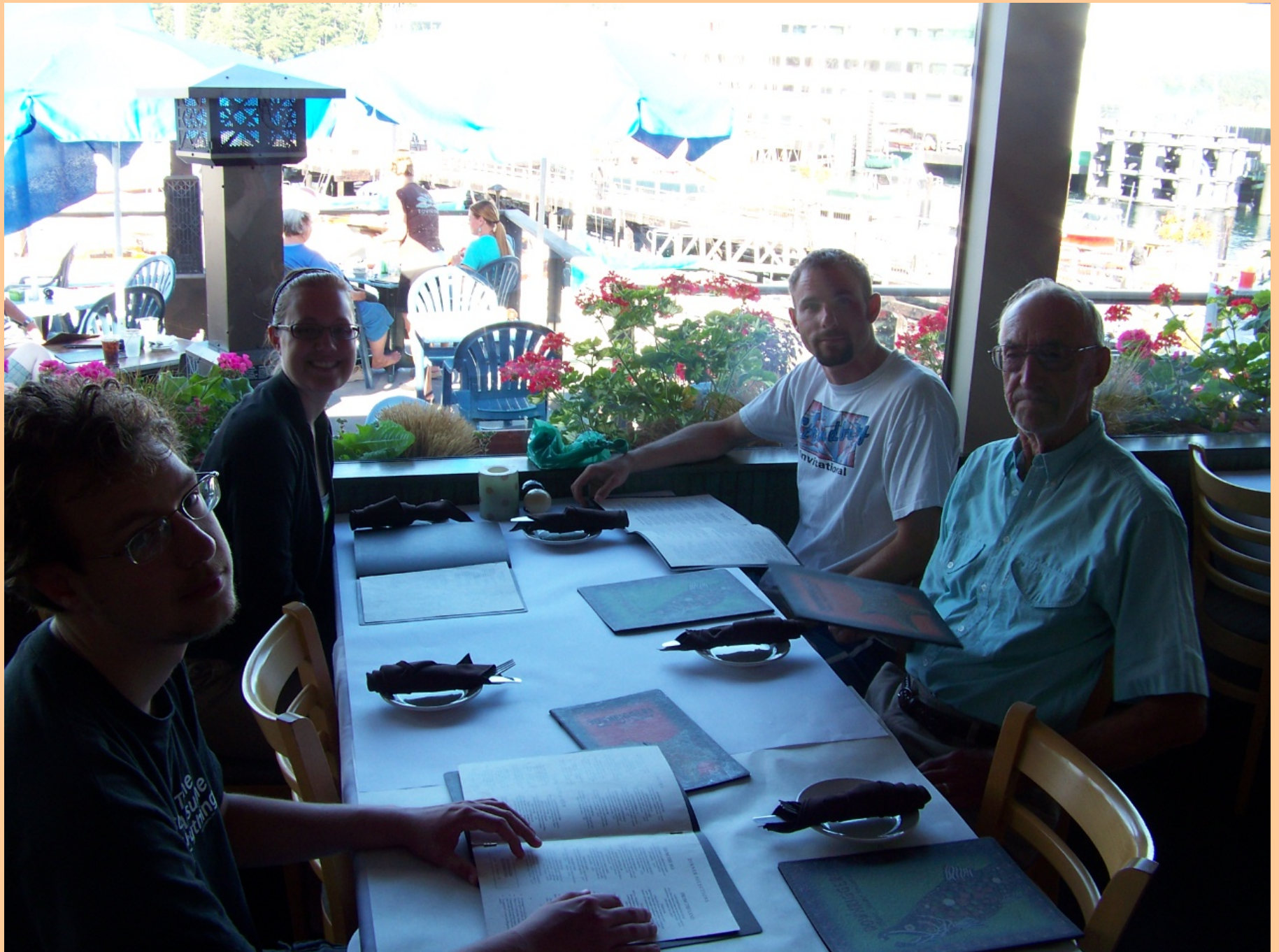
At Local Seafood Restaurant (Later burned down but now rebuilt)