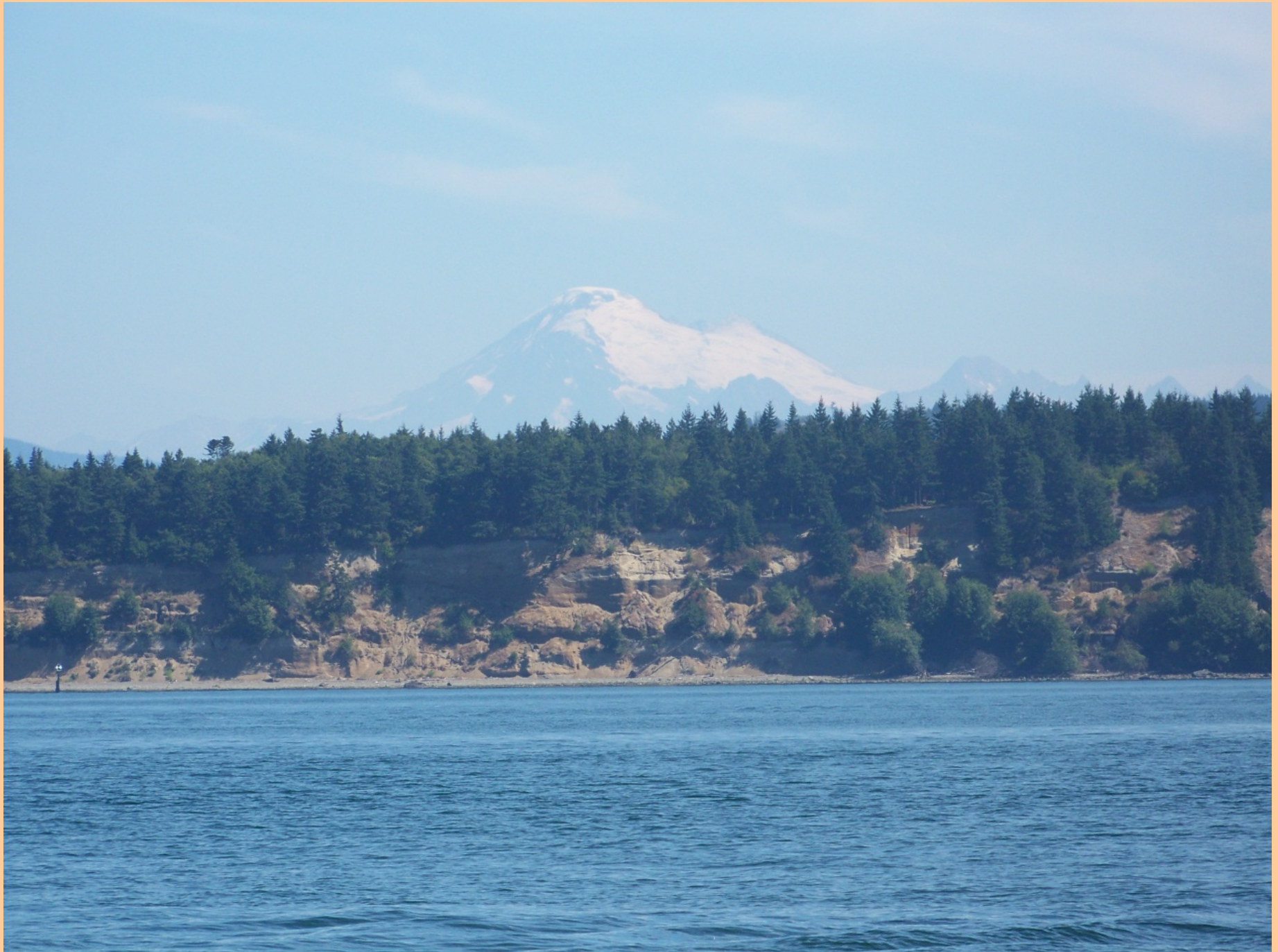
Mount Baker on the Way Back to Anacortes