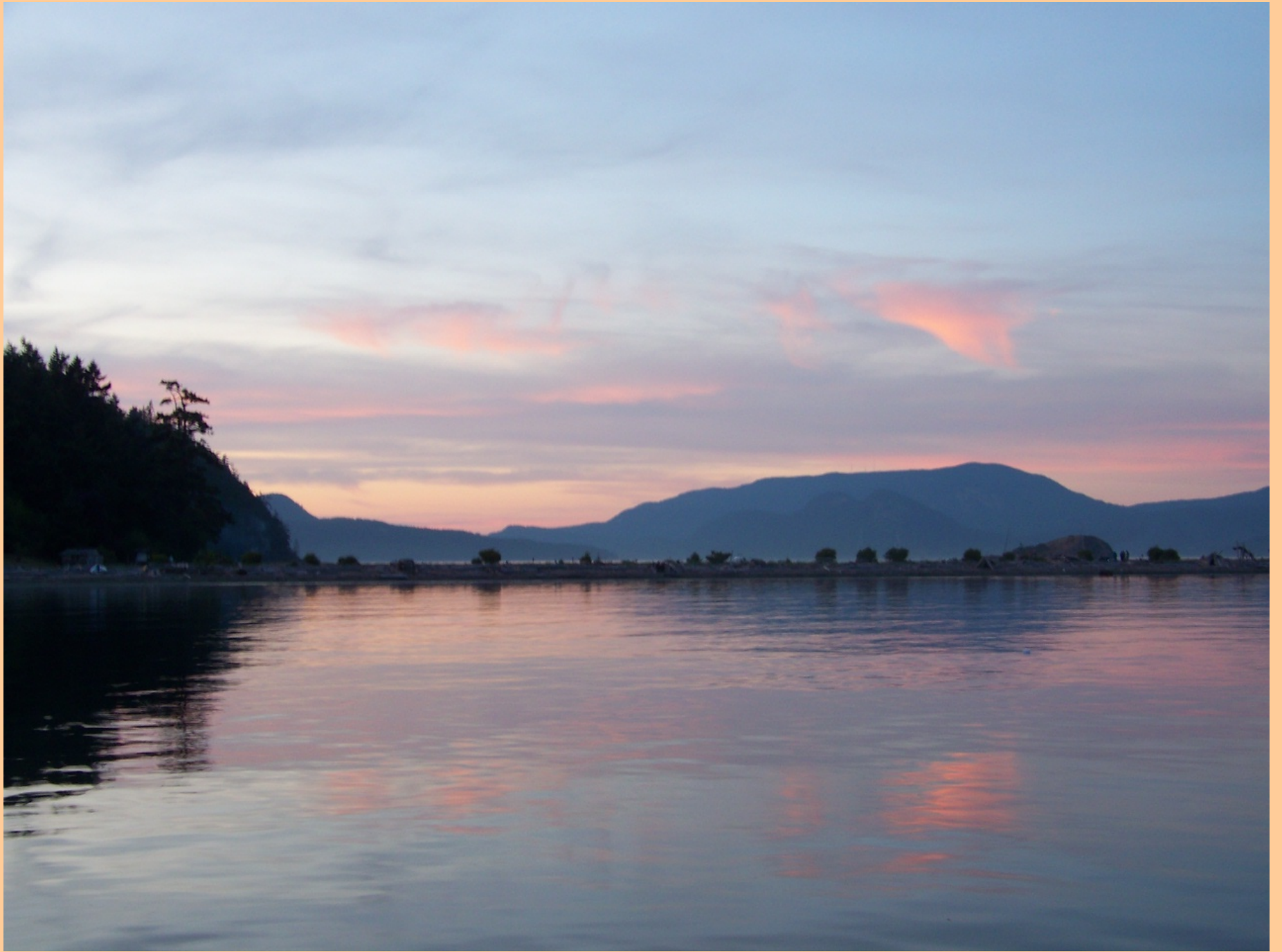
Sundown at Spencer Spit