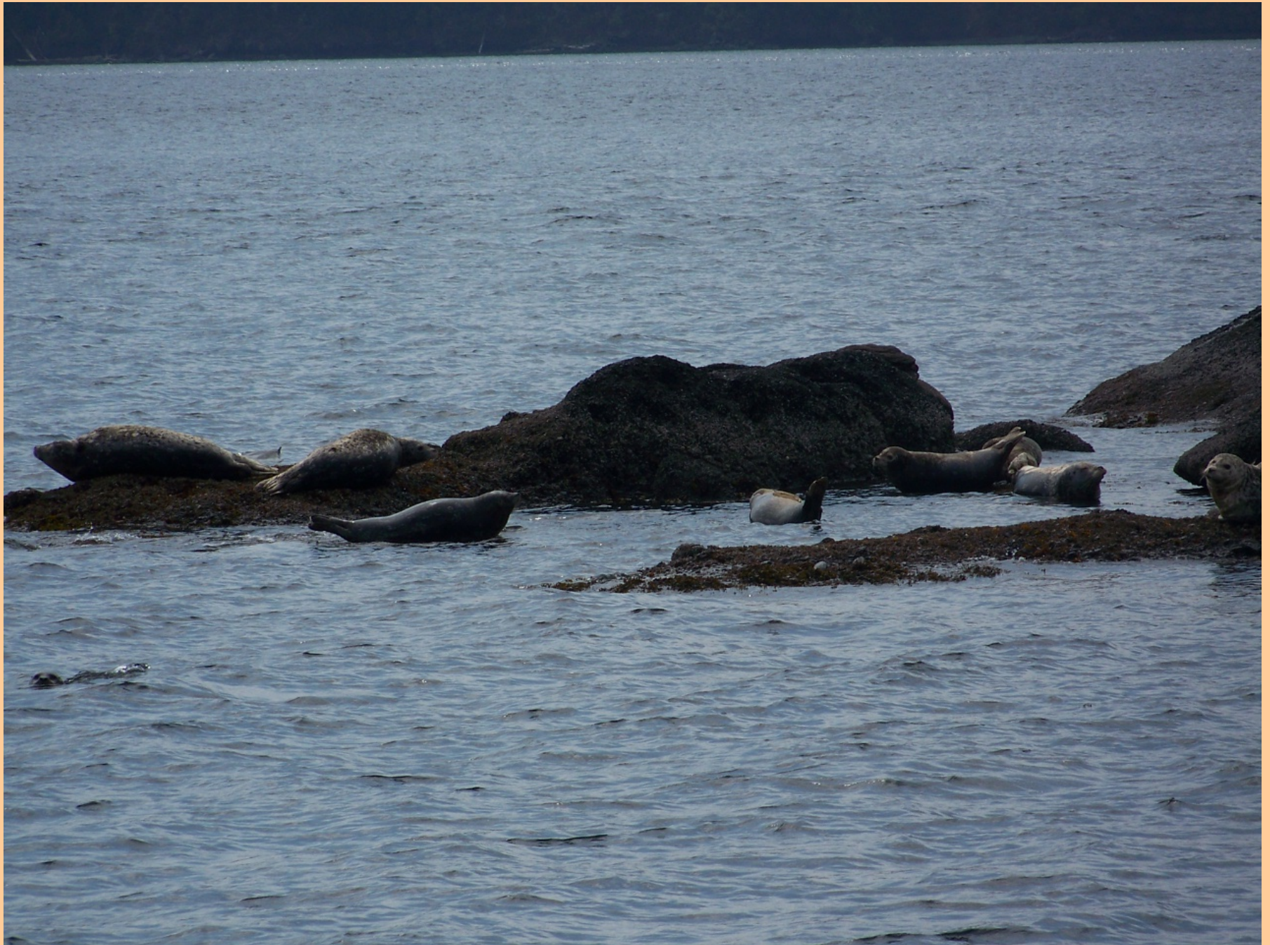
Sea Lions Near The Sisters Islet