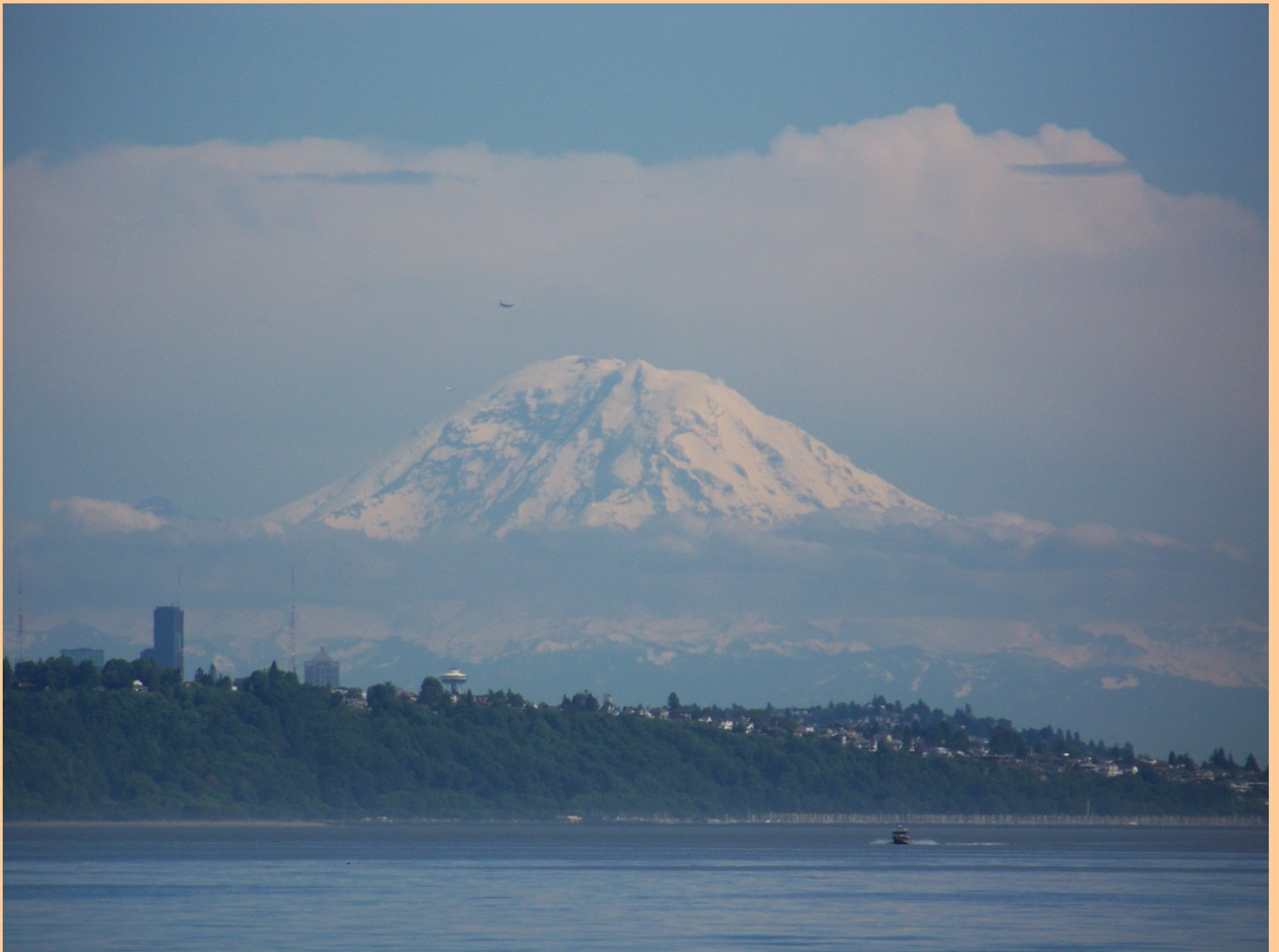
Mount Rainier Over Seattle