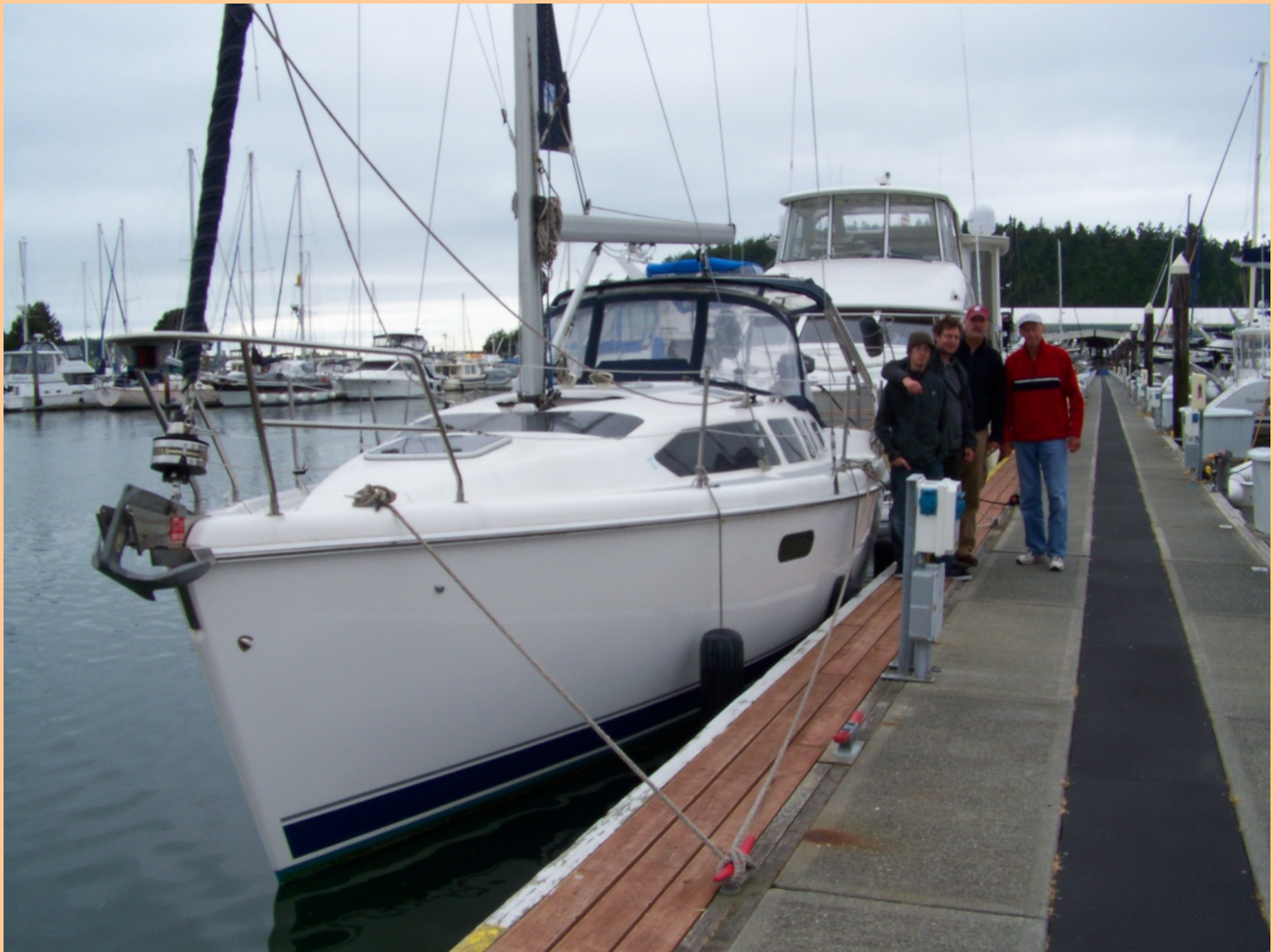
At Skyline Marina Off Rosario Strait