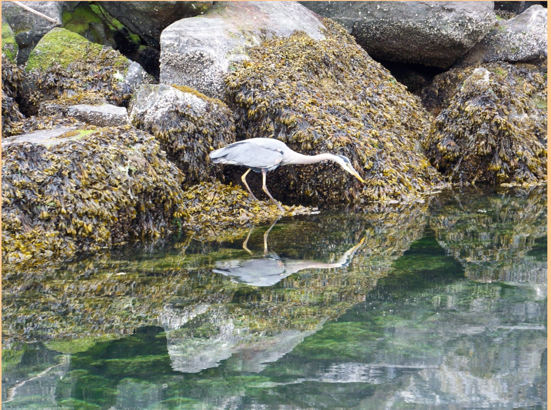
Heron on Blake Island