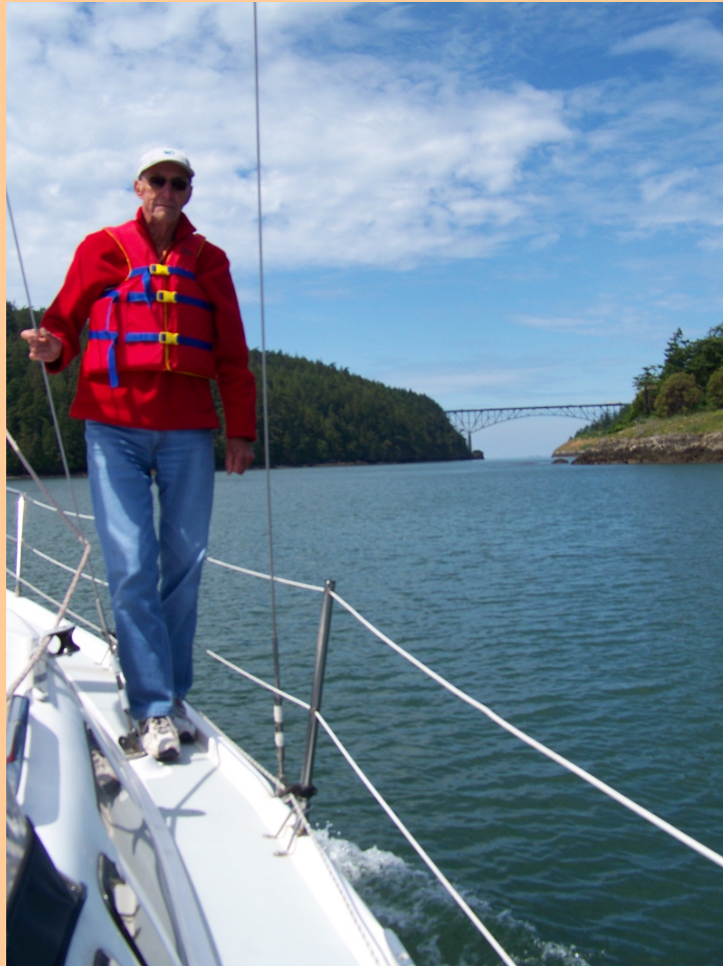
At Deception Pass