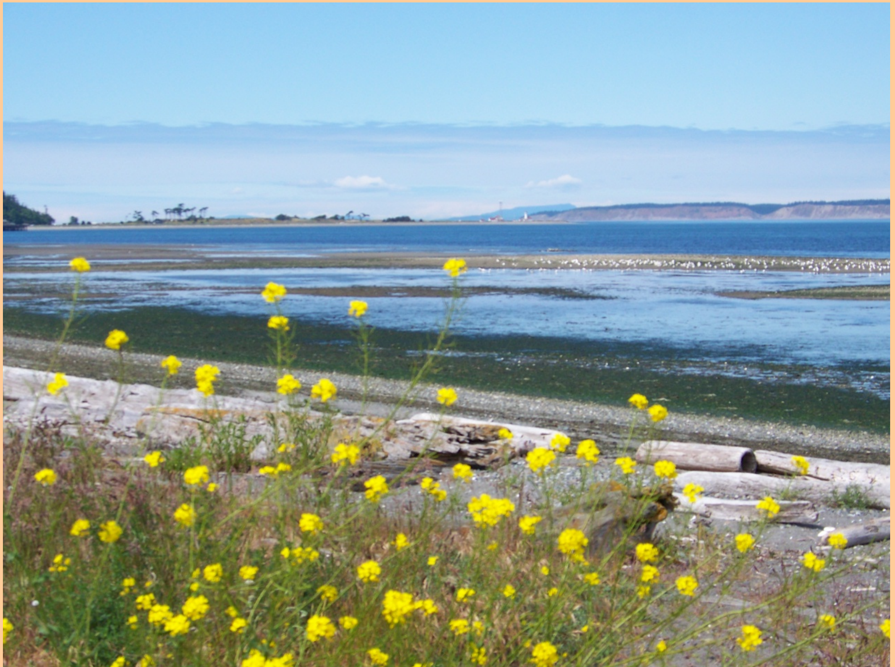
Northwest View from Point Hudson