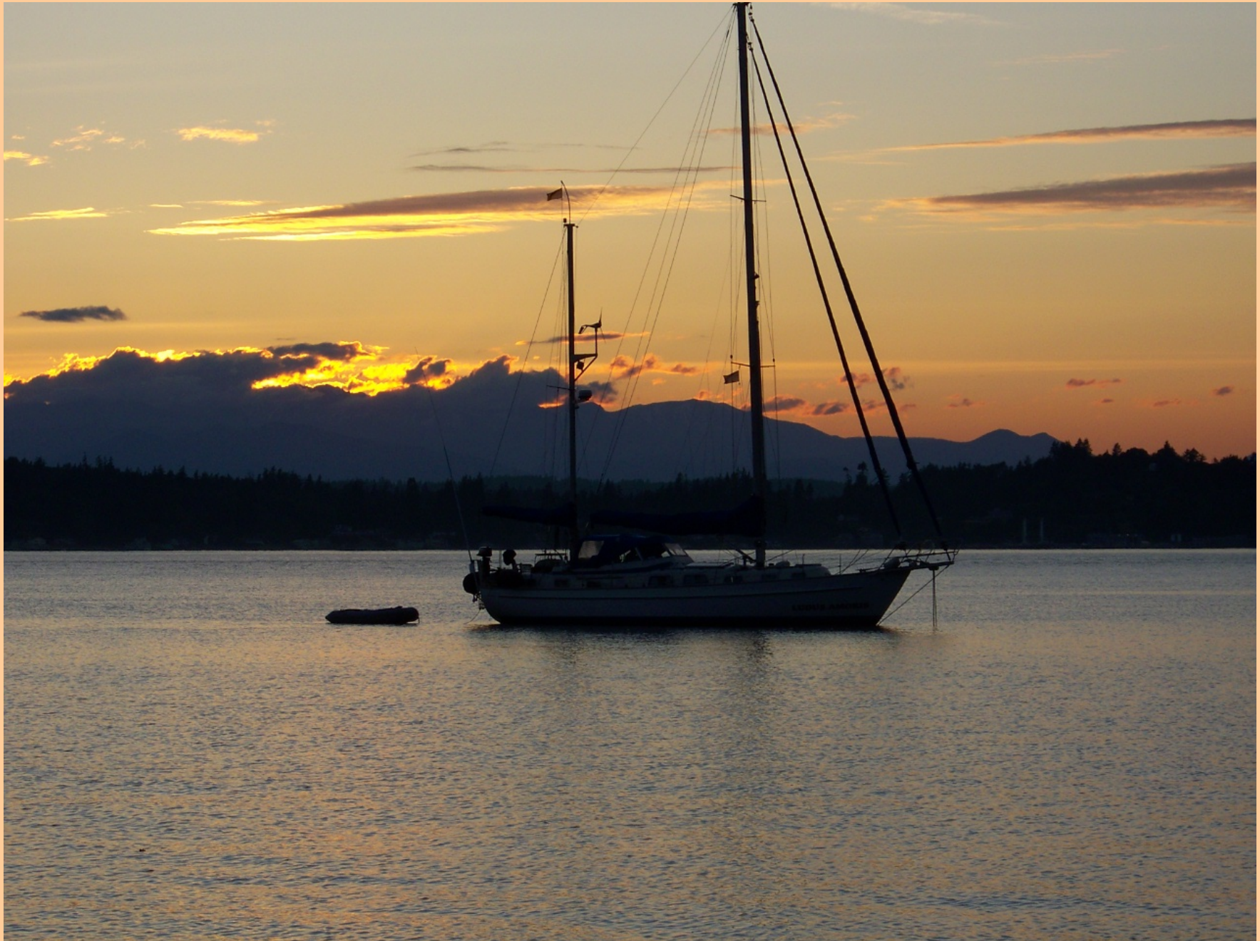
Danish Cruising Couple's Ketch on the South Side of Blake Island