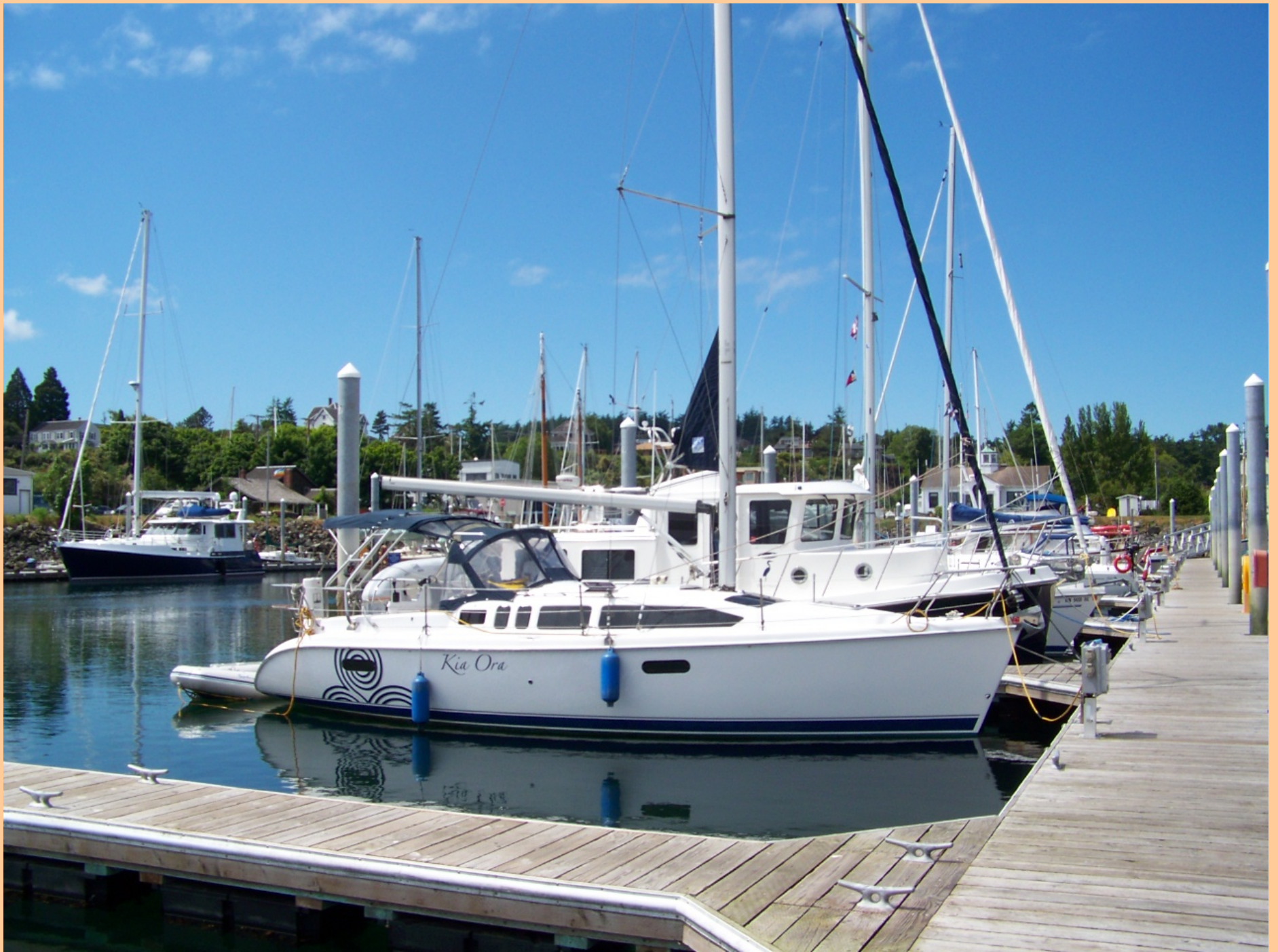
Kia Ora at Point Hudson (Port Townsend)