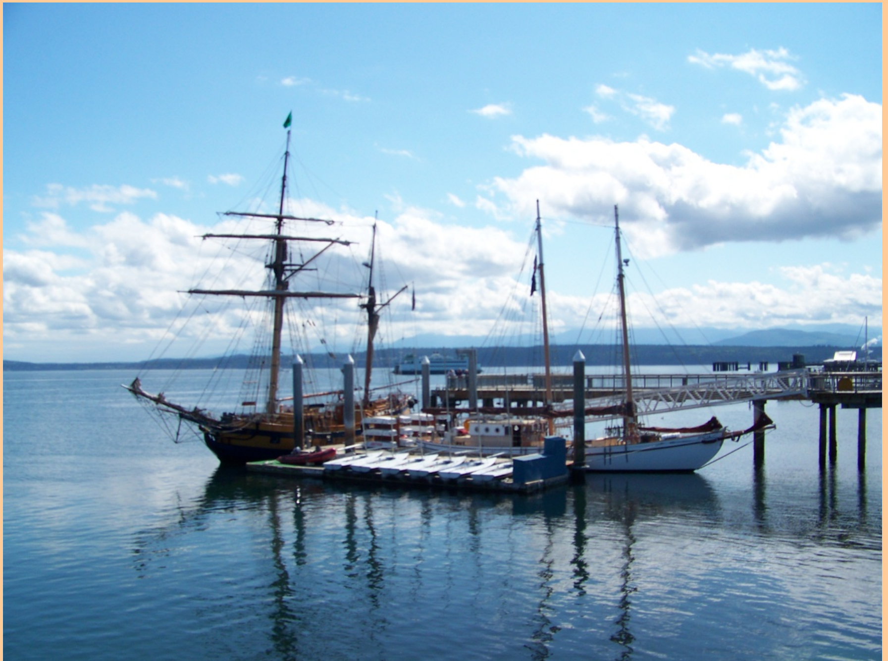
Hawaiian Chieftain and Adventuress at Port Townsend Maritime Center