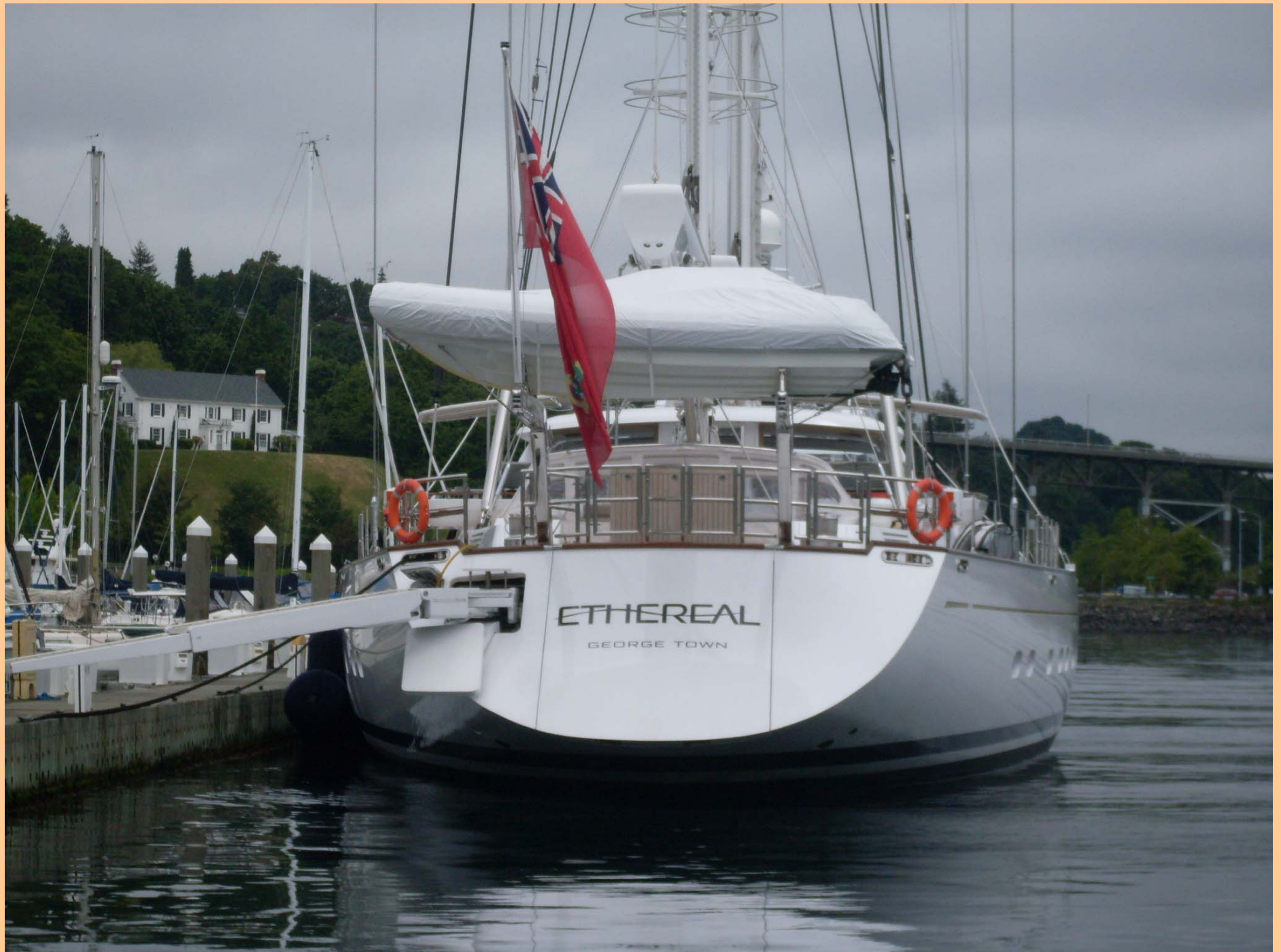
Huge Sailboat from New Zealand