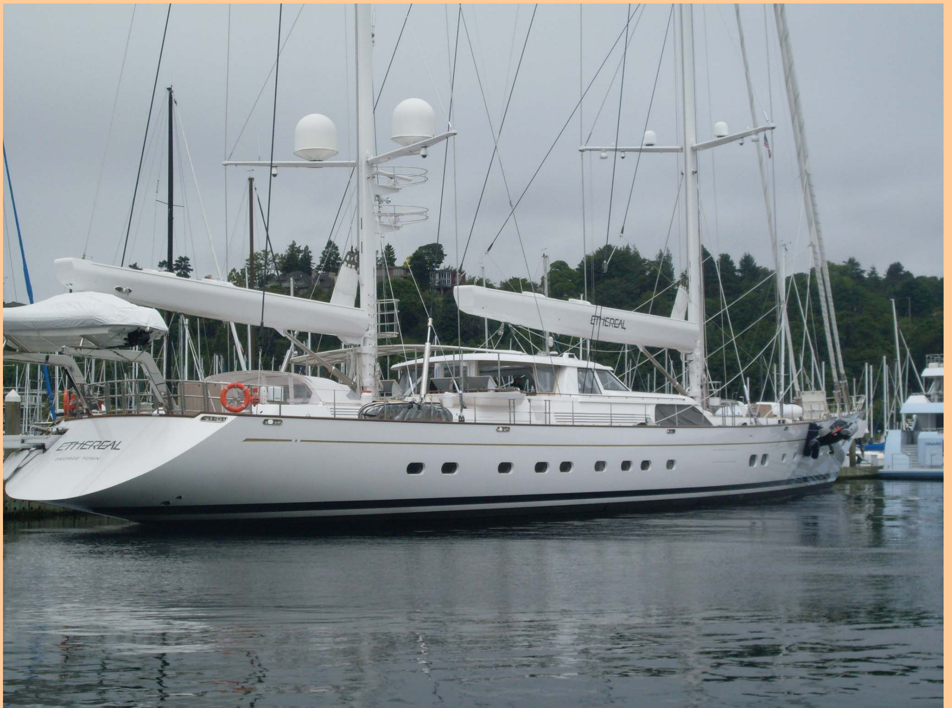
Huge Sailboat at Elliot Bay Marina