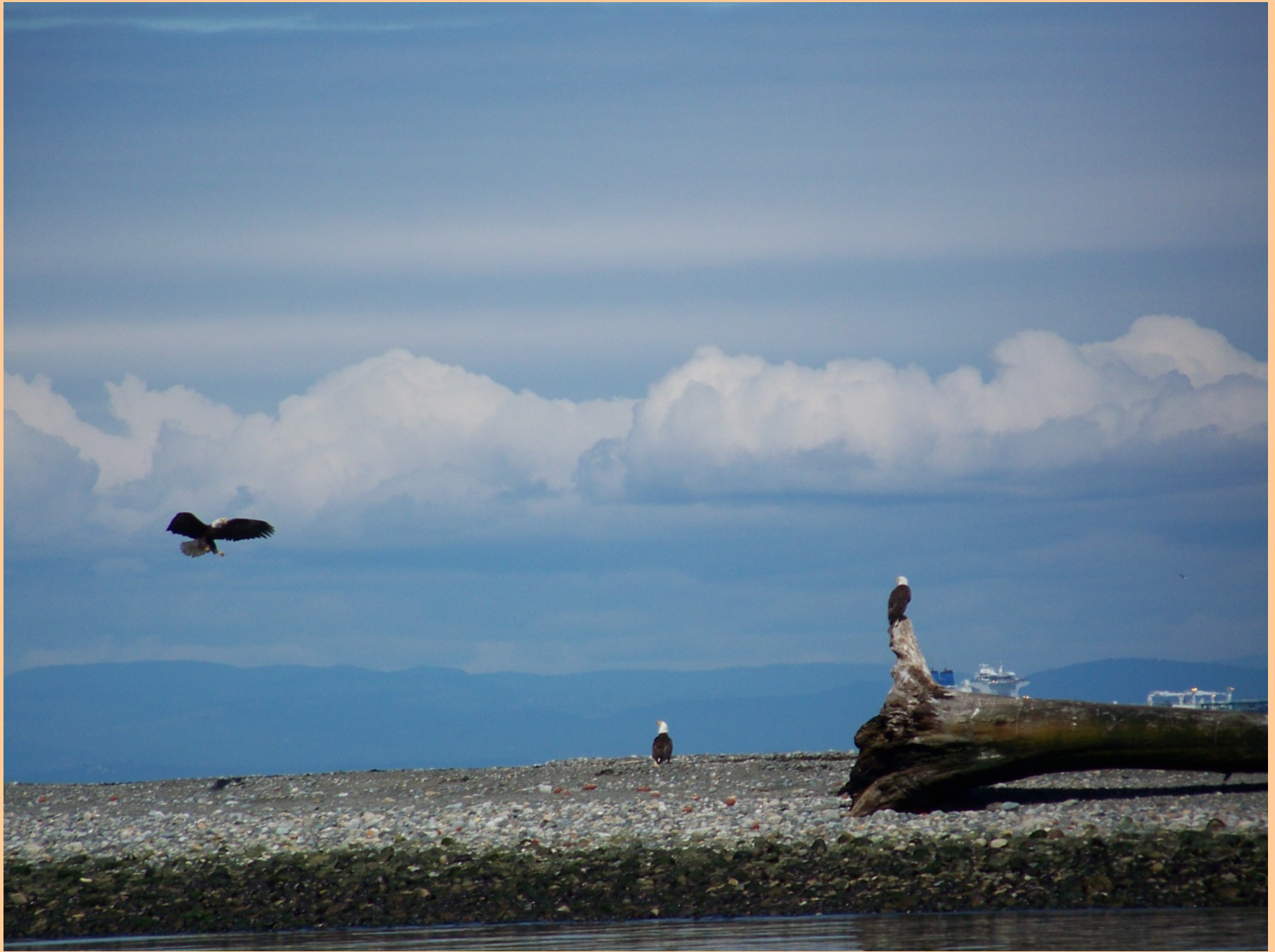
Bald Eagles on Smith Island in Strait of Juan De Fuca