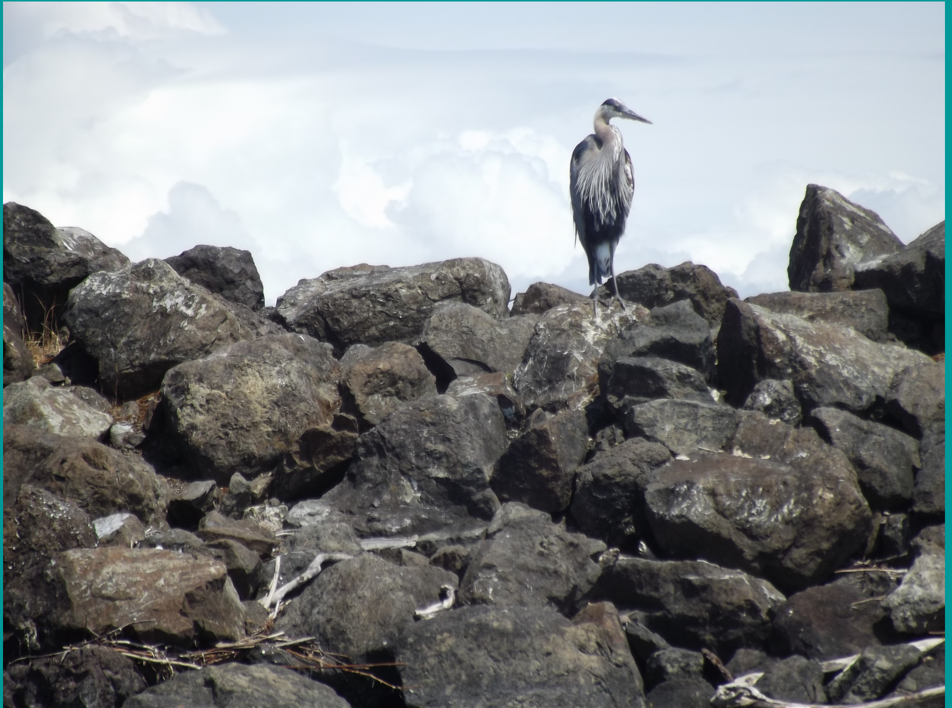
Heron on Blake Island