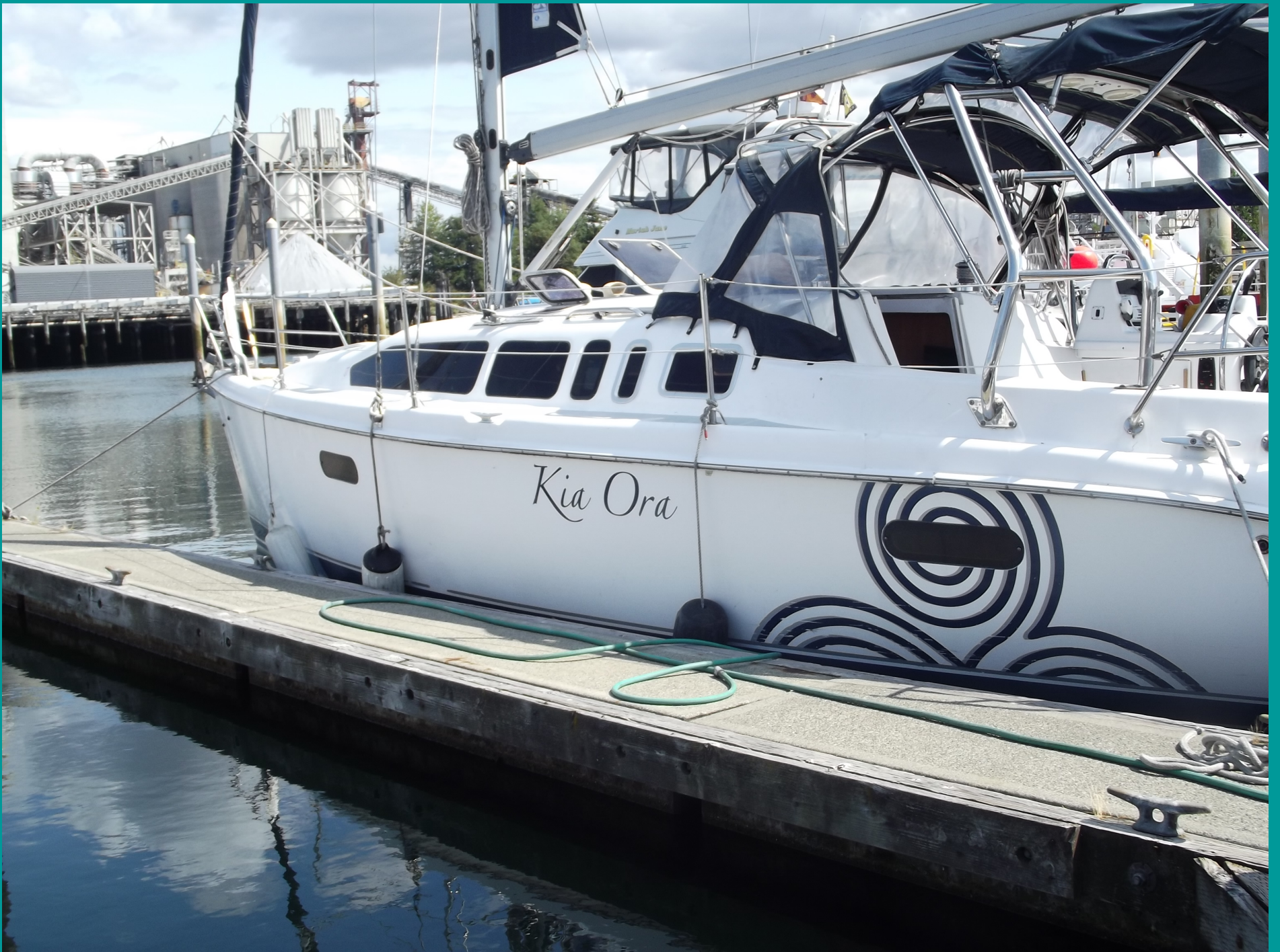
Kia Ora at Harbor Island