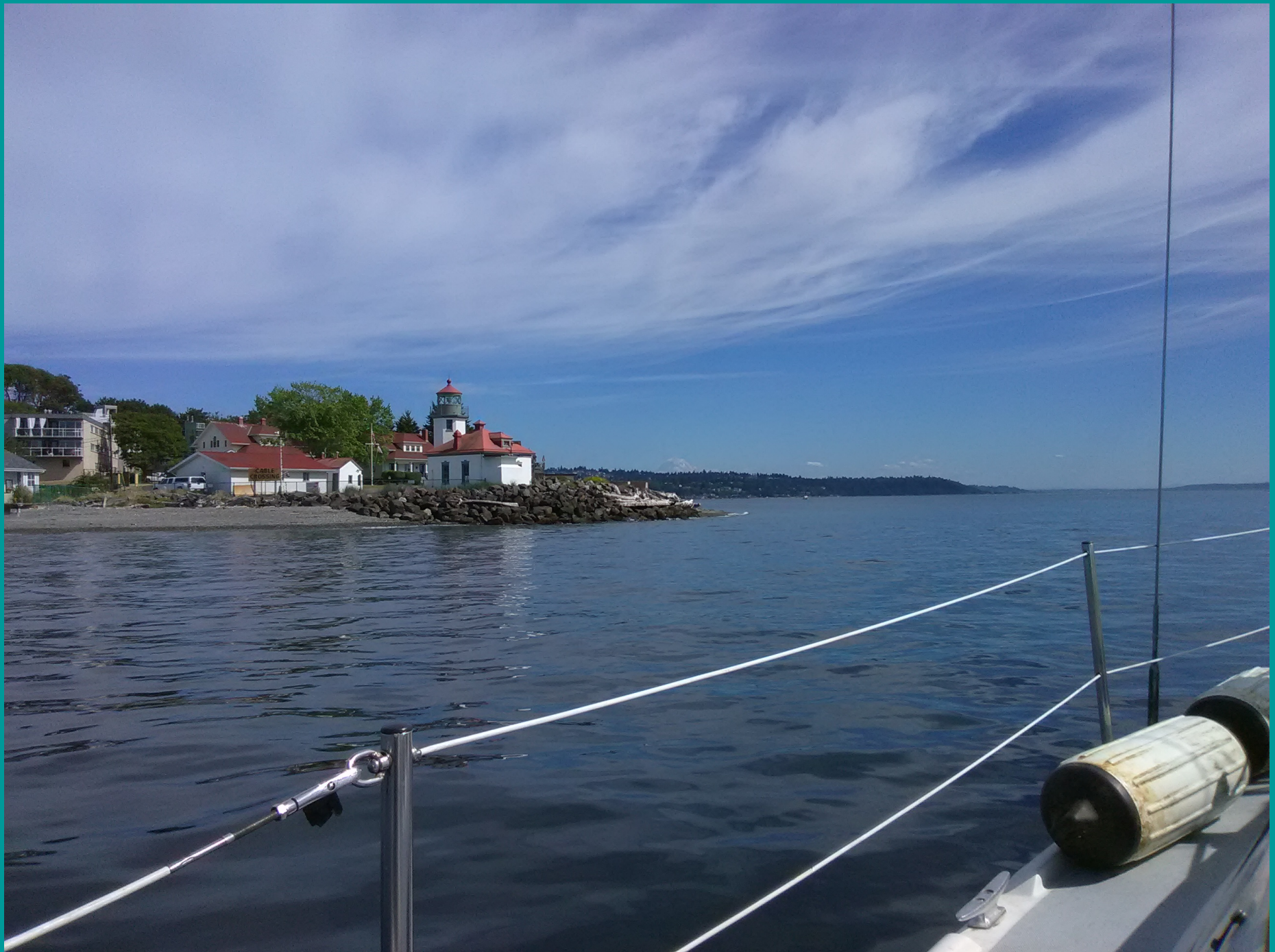
Alki Lighthouse on the way to Bremerton