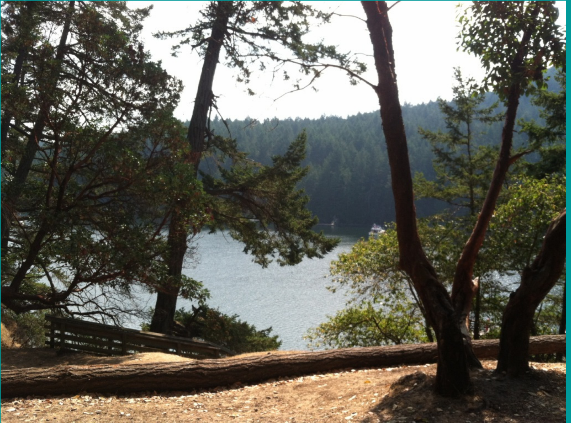
Reid Harbor at Stuart Island