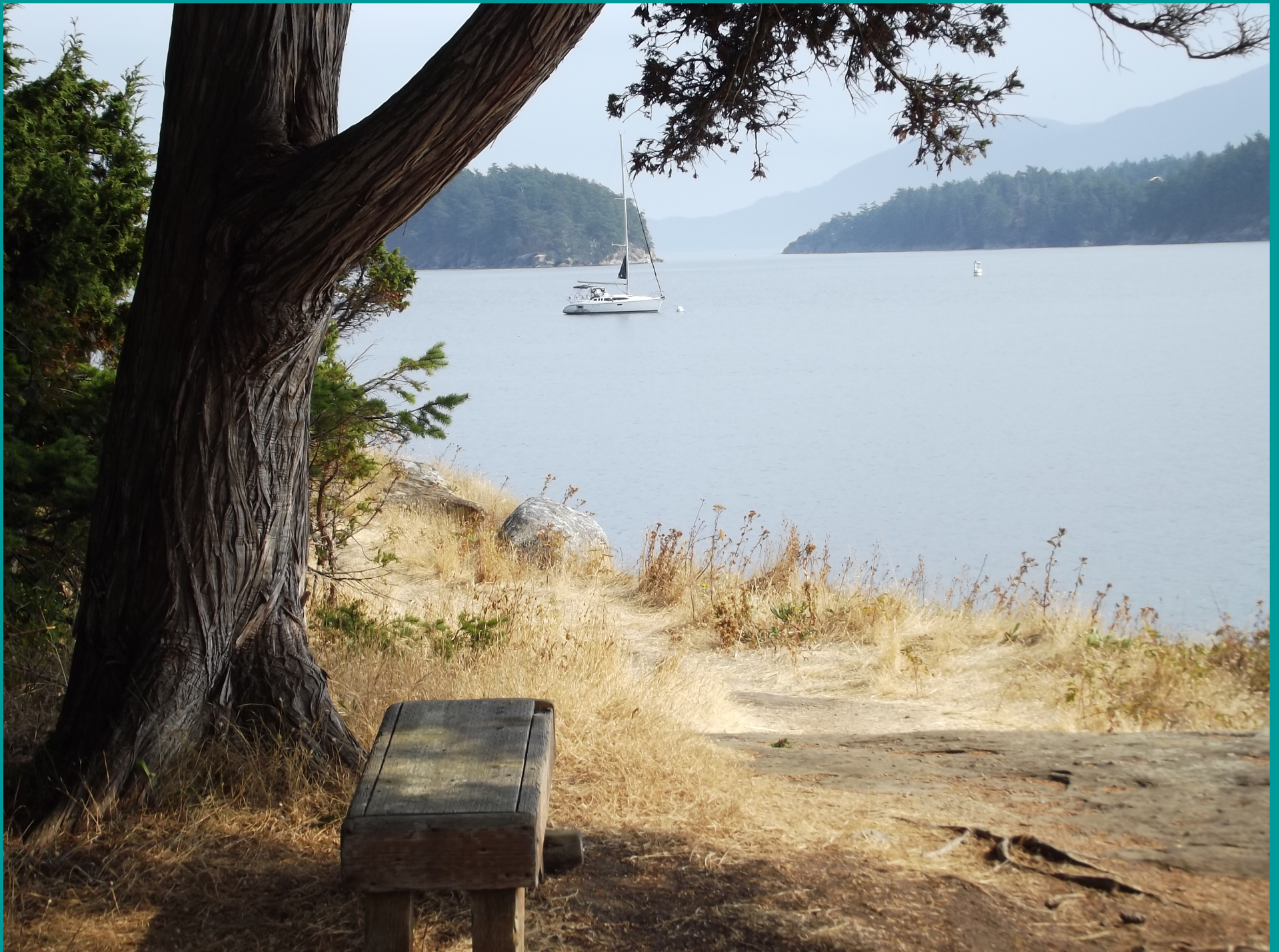
Kia Ora on Echo Bay