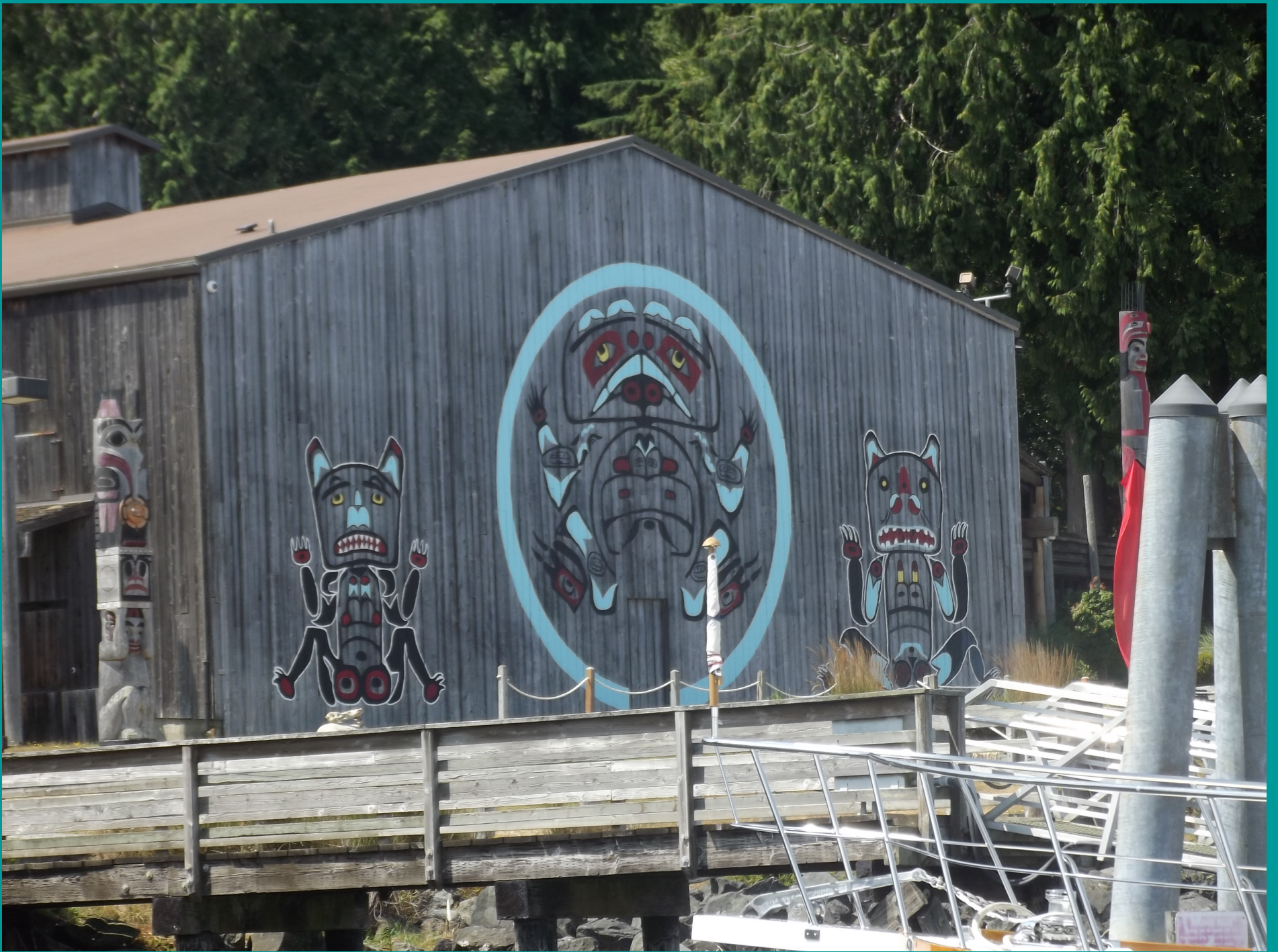
Indian Salmon House – Blake Island