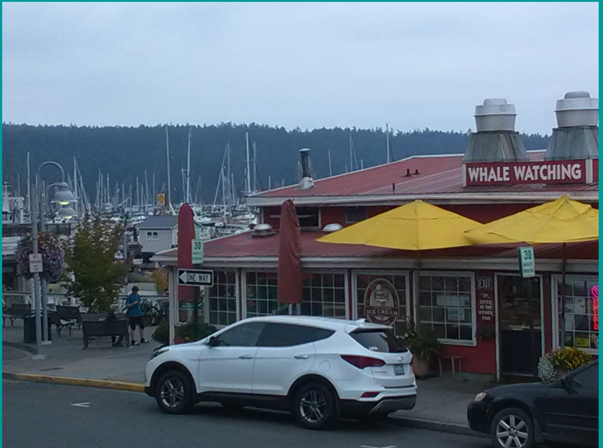
At Friday Harbor