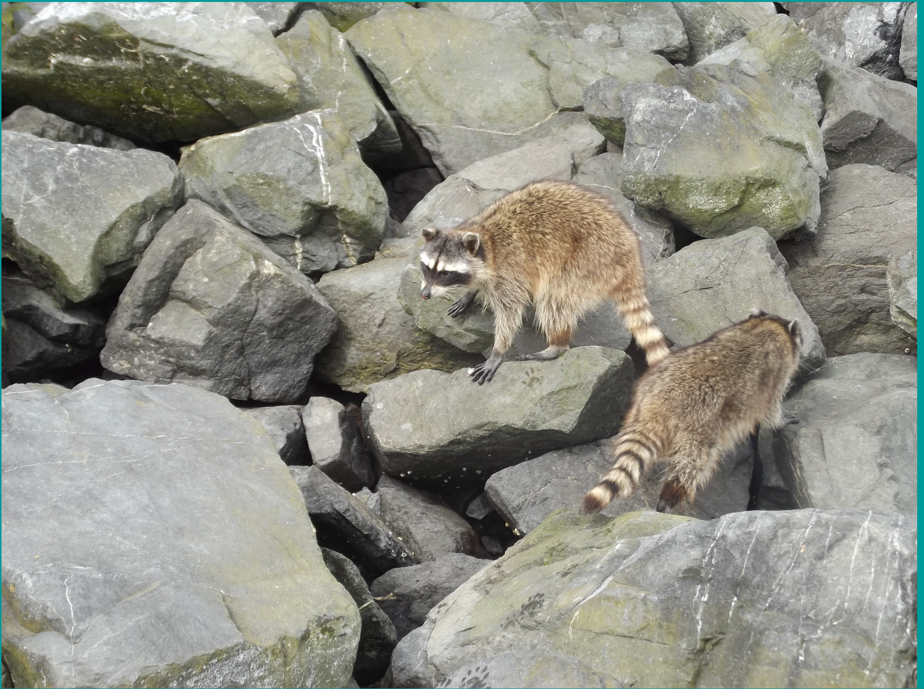
Racoons Looking for Lunch