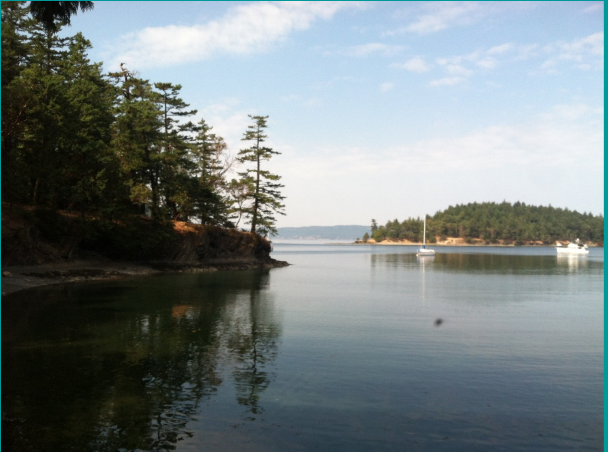
Prevoost Harbor at Stuart Island