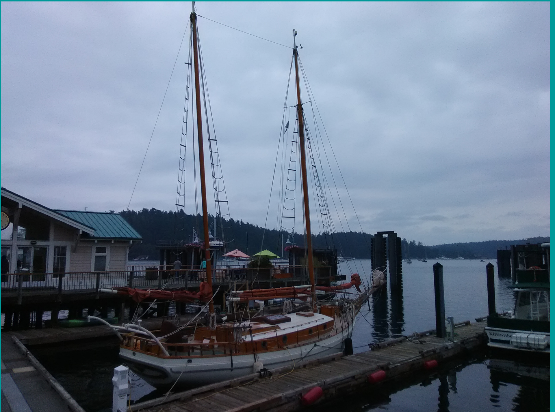
At Friday Harbor