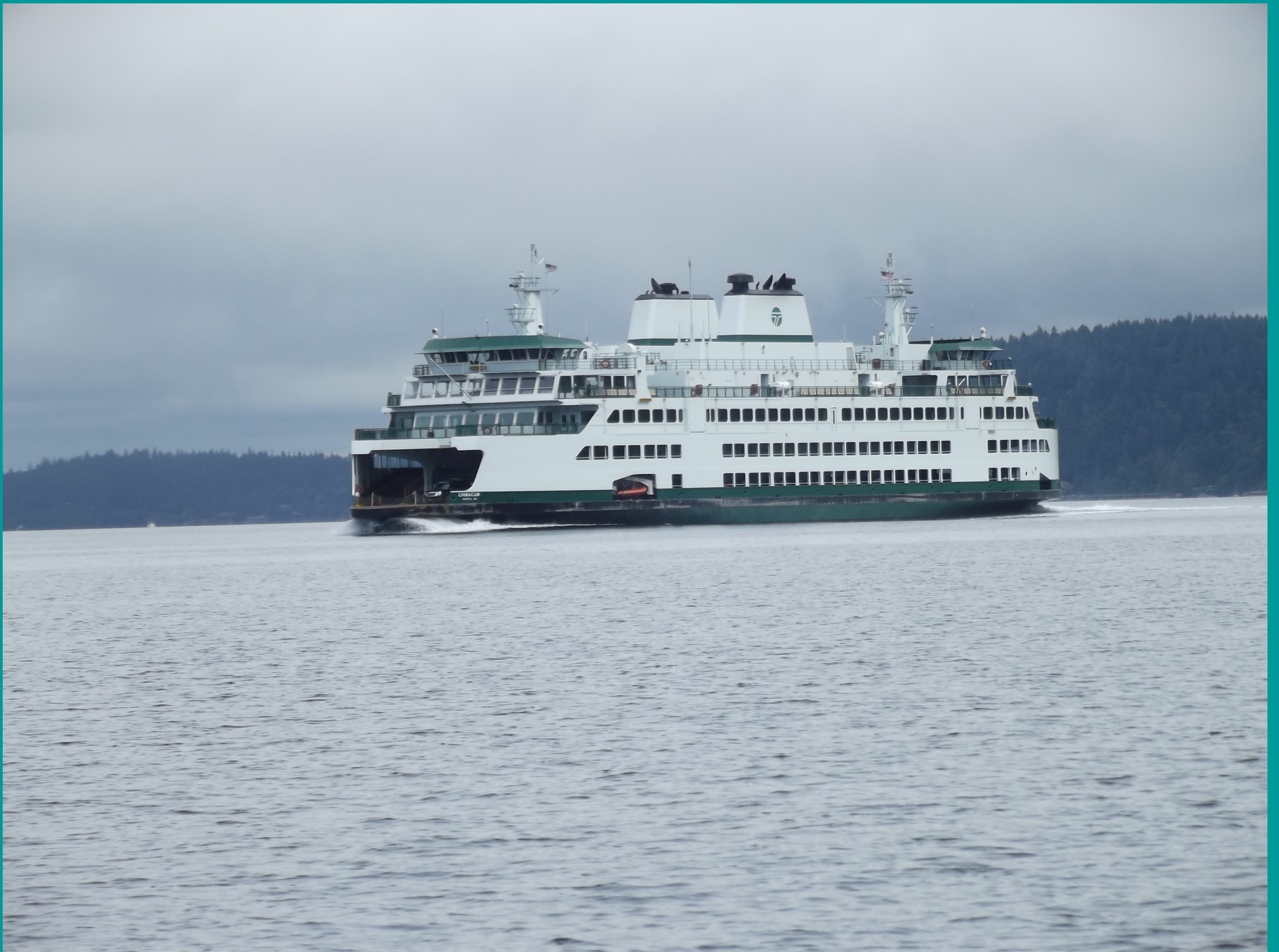
WA State Ferry