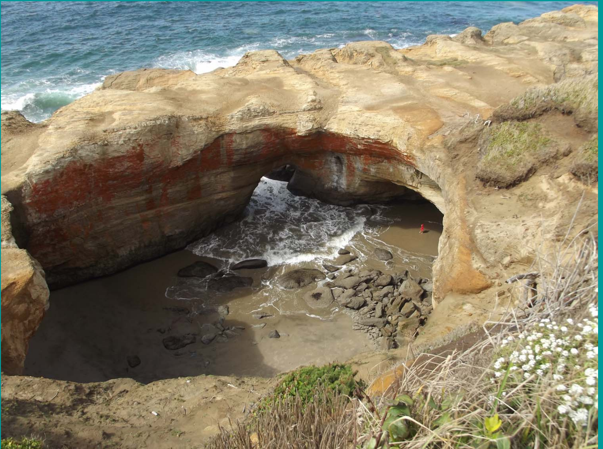
Devil's Punch Bowl