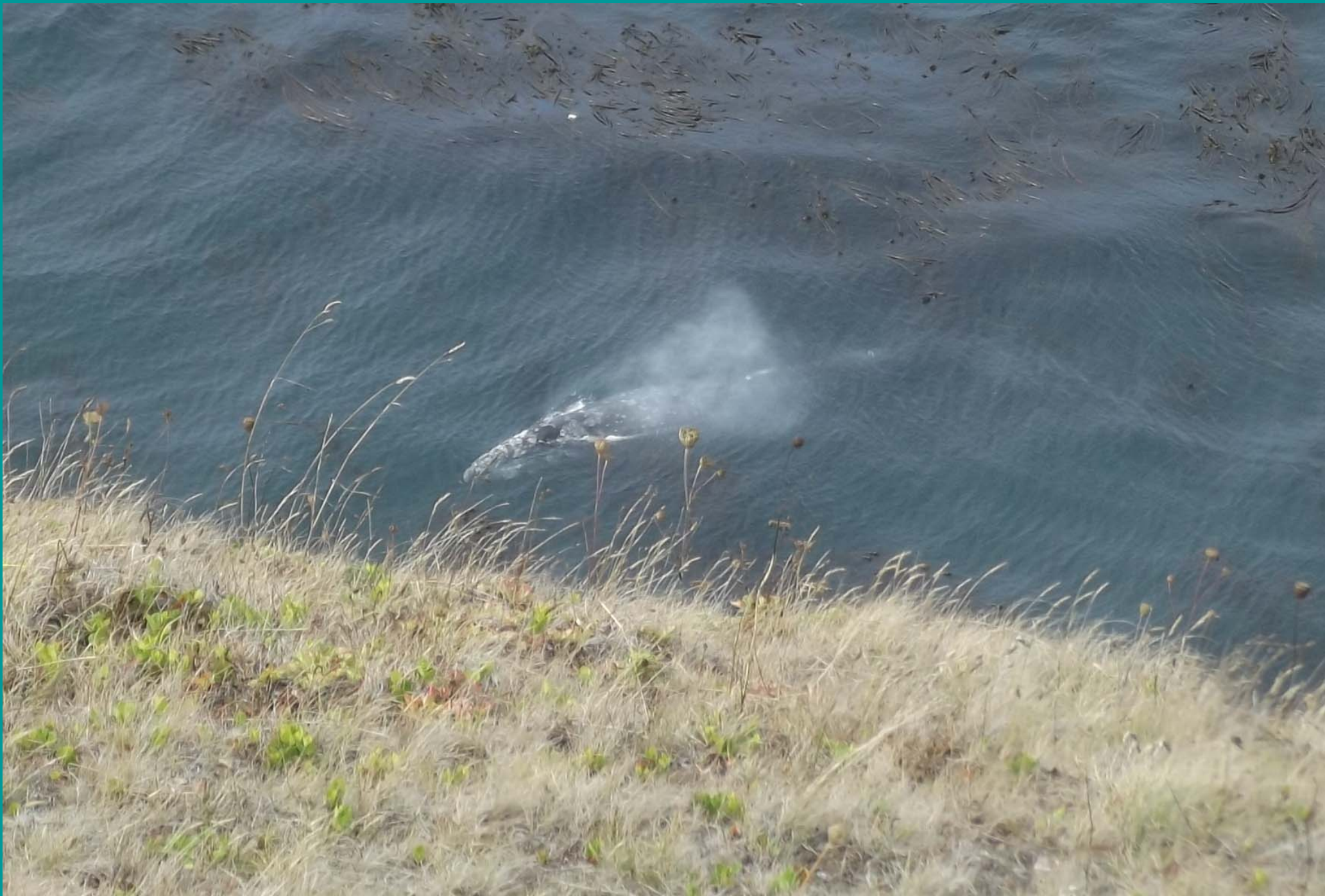
Spouting Gray Whale Below Cape Foulweather