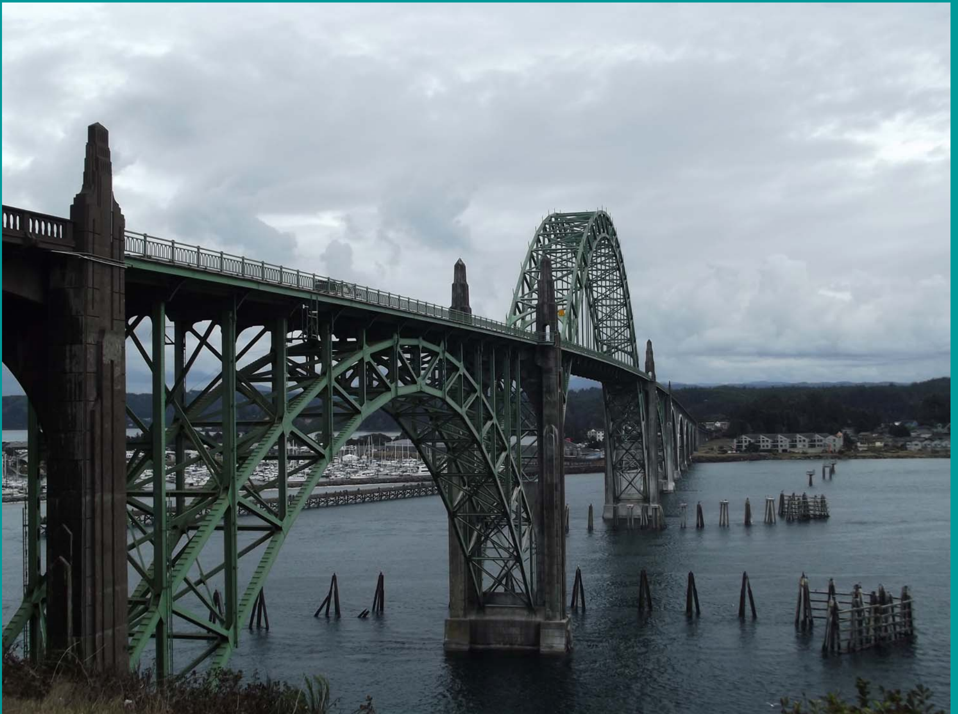
Bridge at Newport