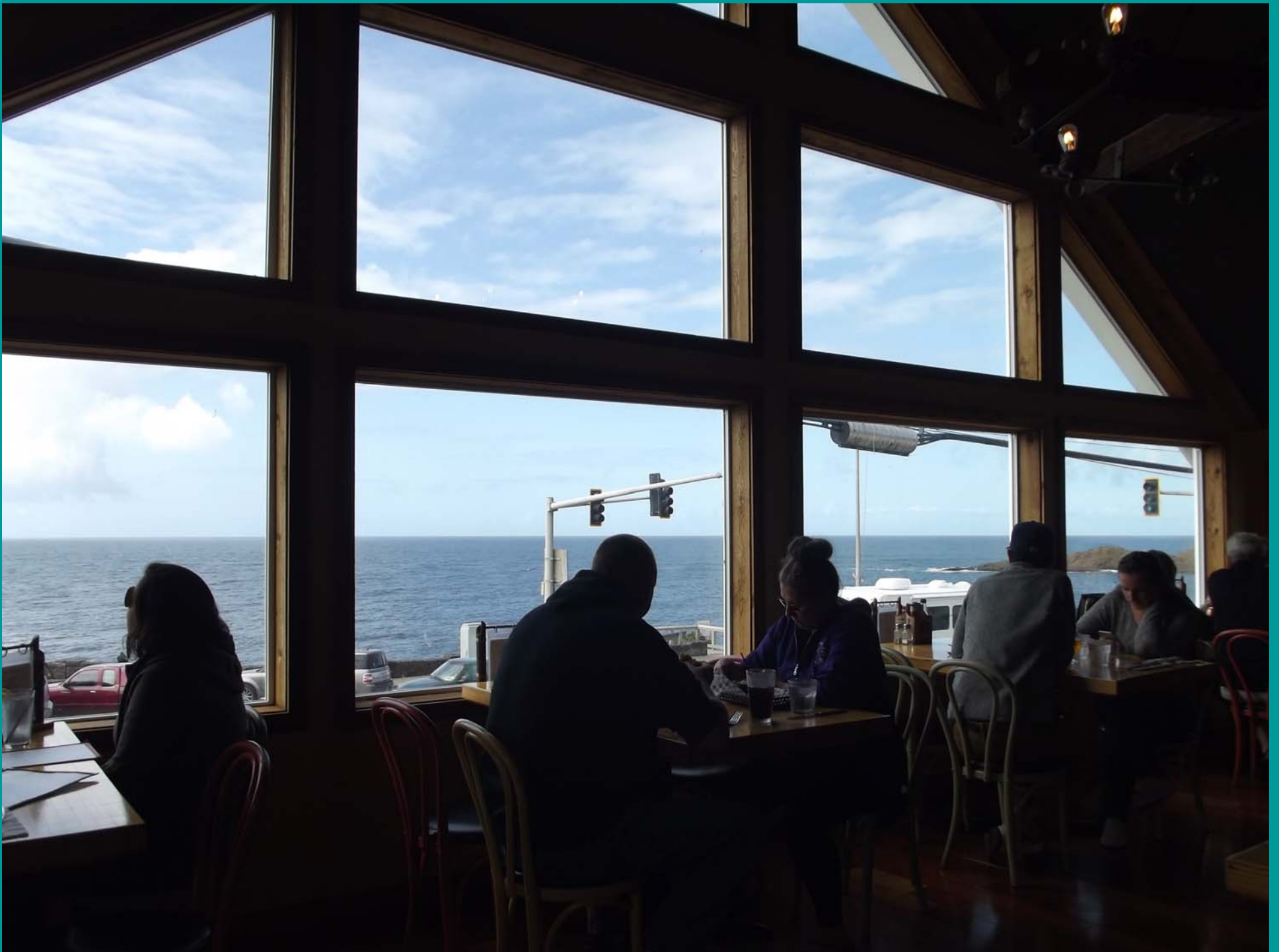
Depoe Bay Brewhouse