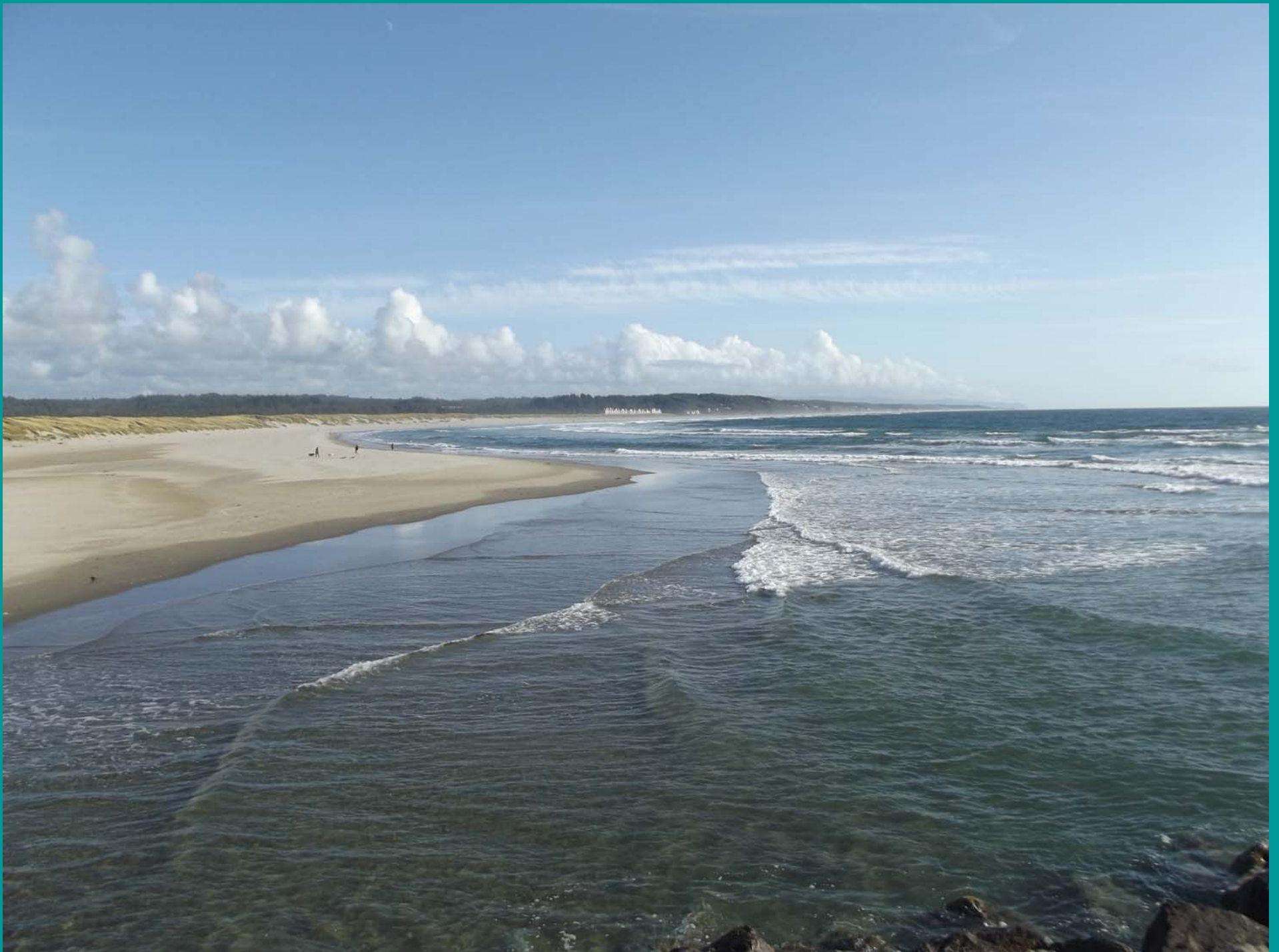
Beach South of South Jetty