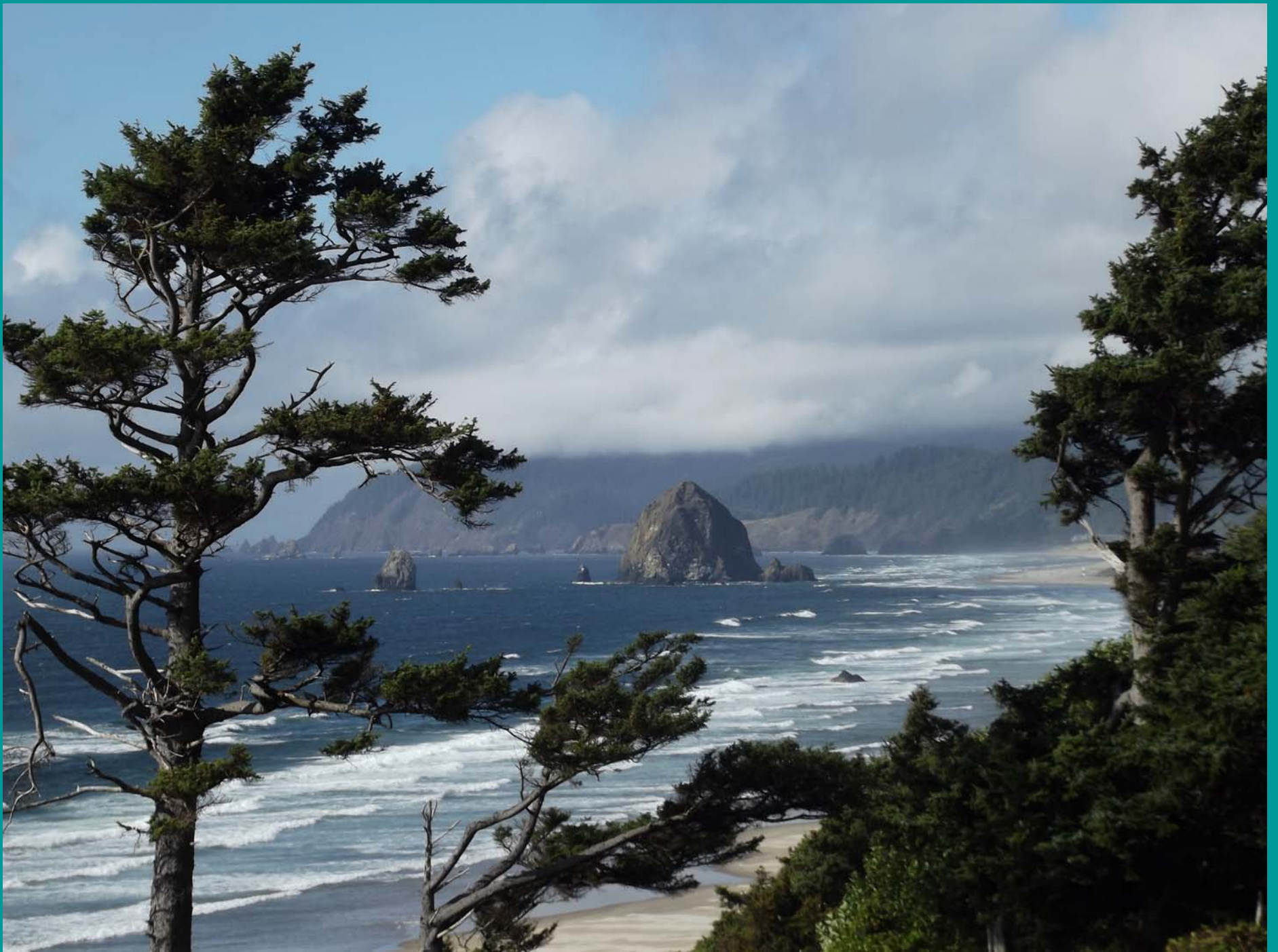
Cannon Beach OR