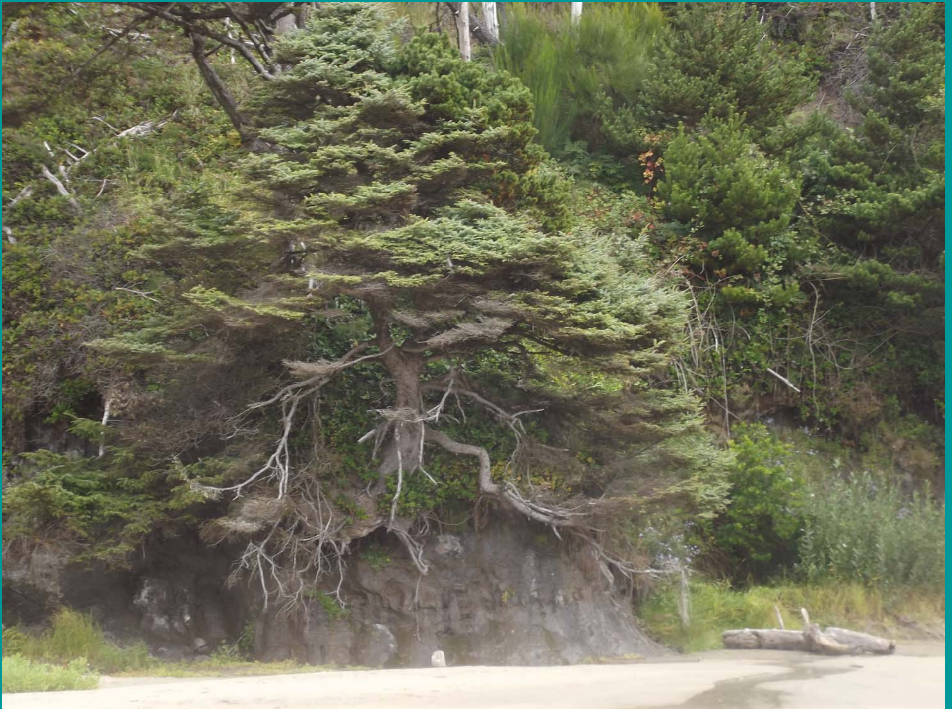
Tree at Otter Rock