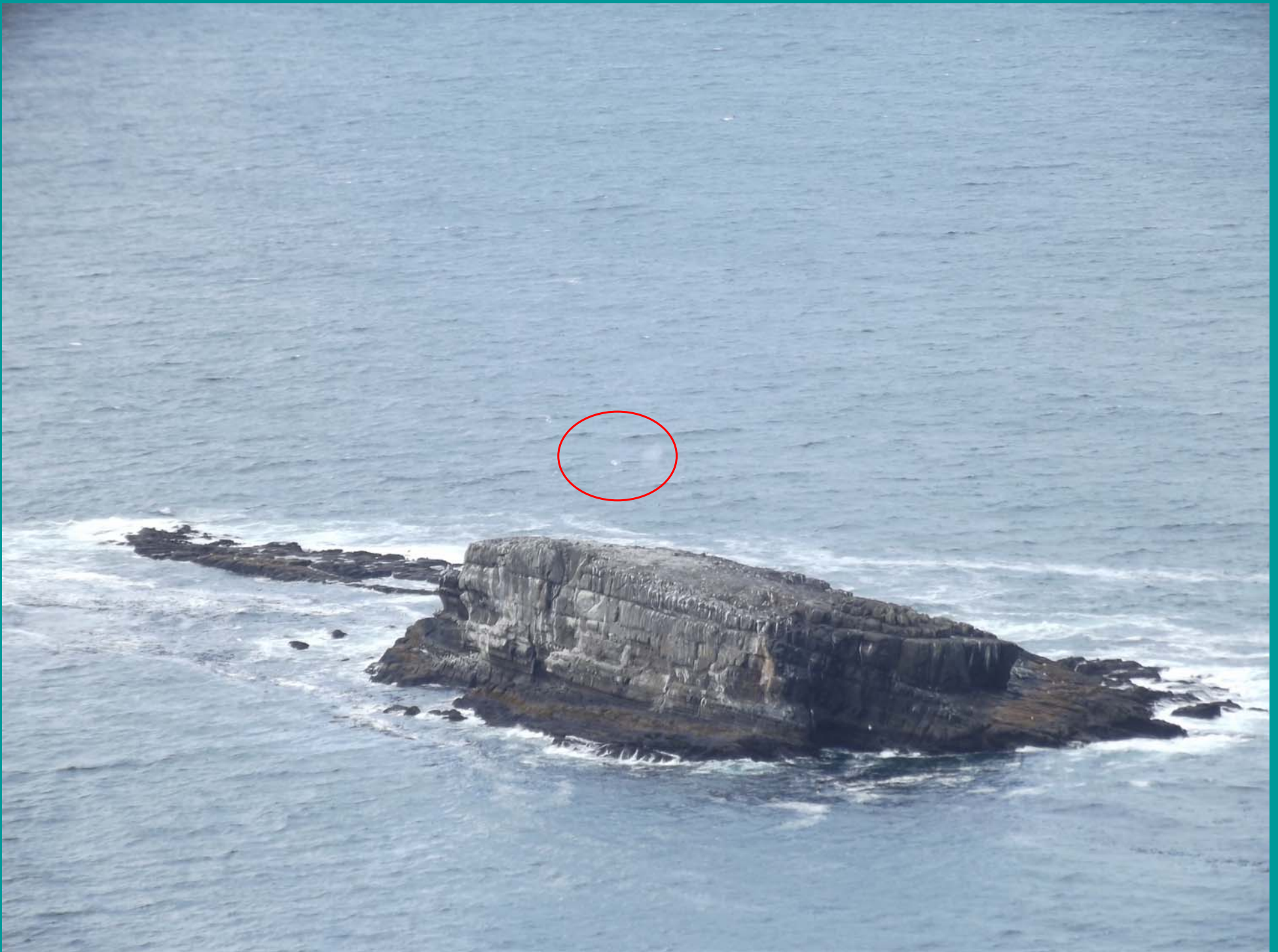
Whale Spouting Beyond Gull Rock