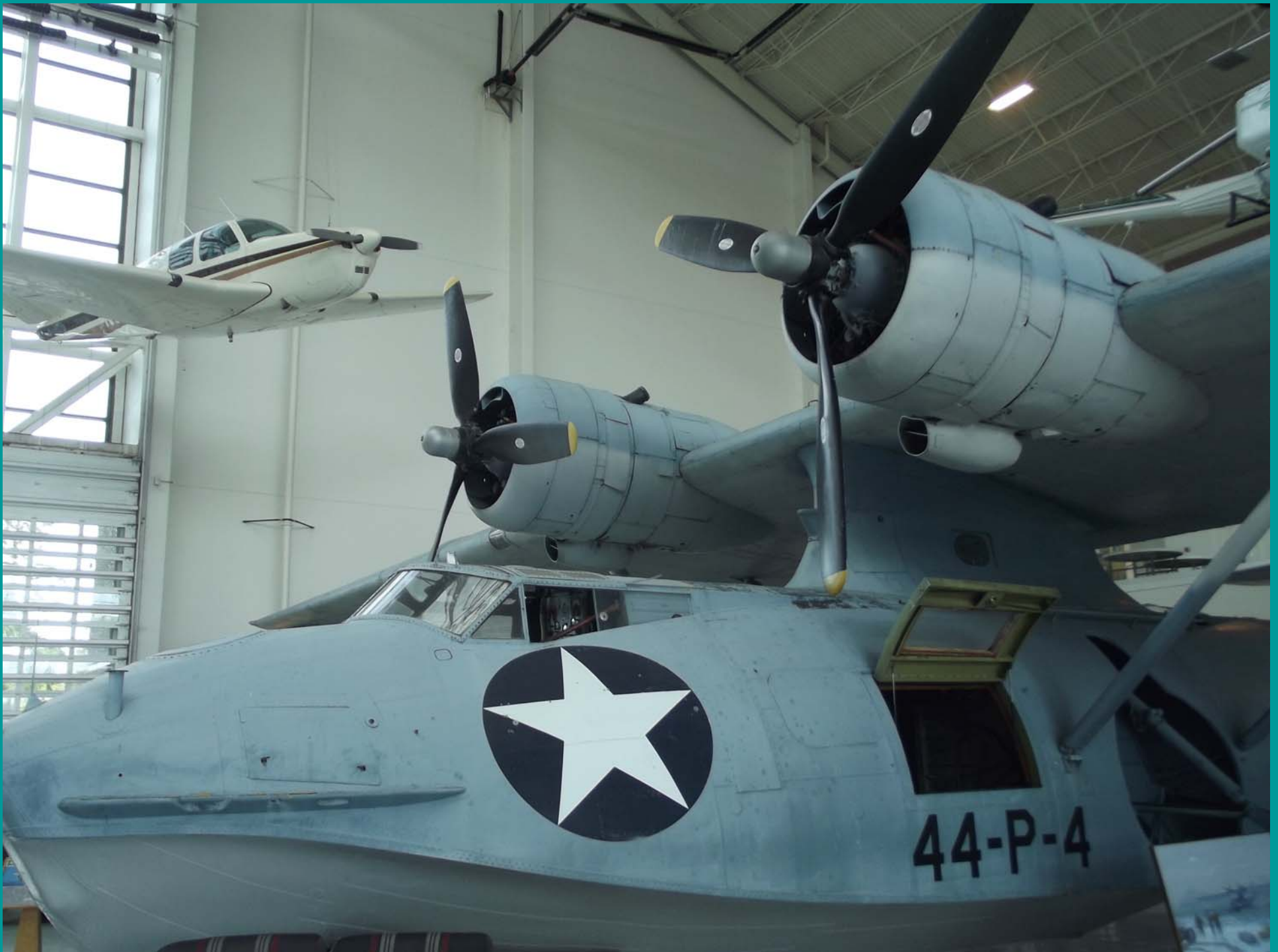
PBY-McMinnville Air/Space Museum