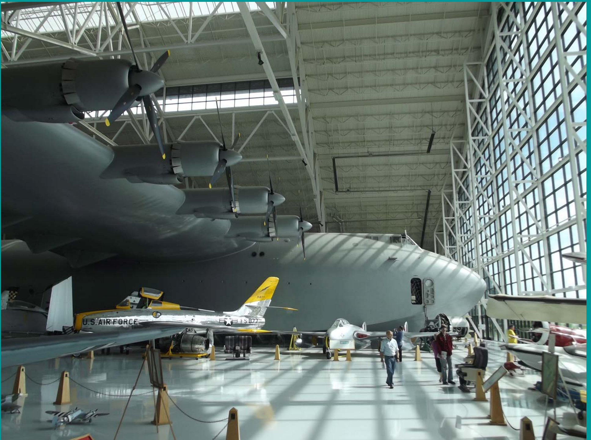
Spruce Goose-McMinnville Air/Space Museum 22