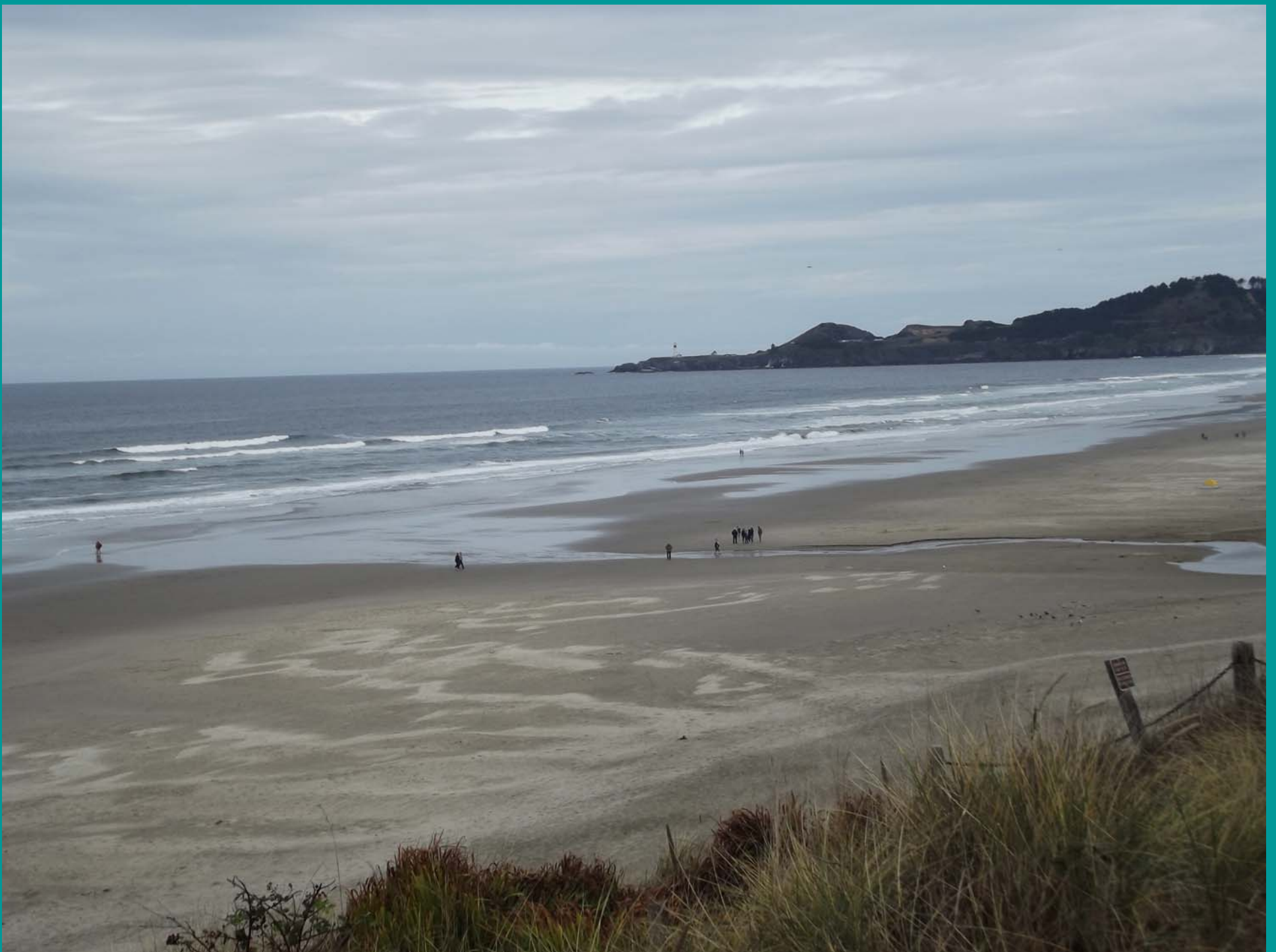
Beach and Yaquina Bay Lighthouse