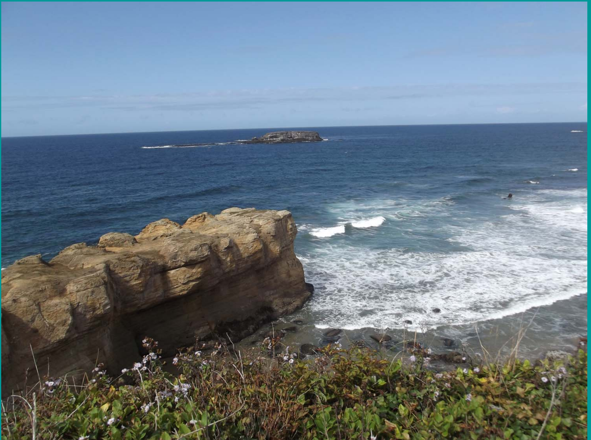
Gull Rock from Devil's Punch Bowl