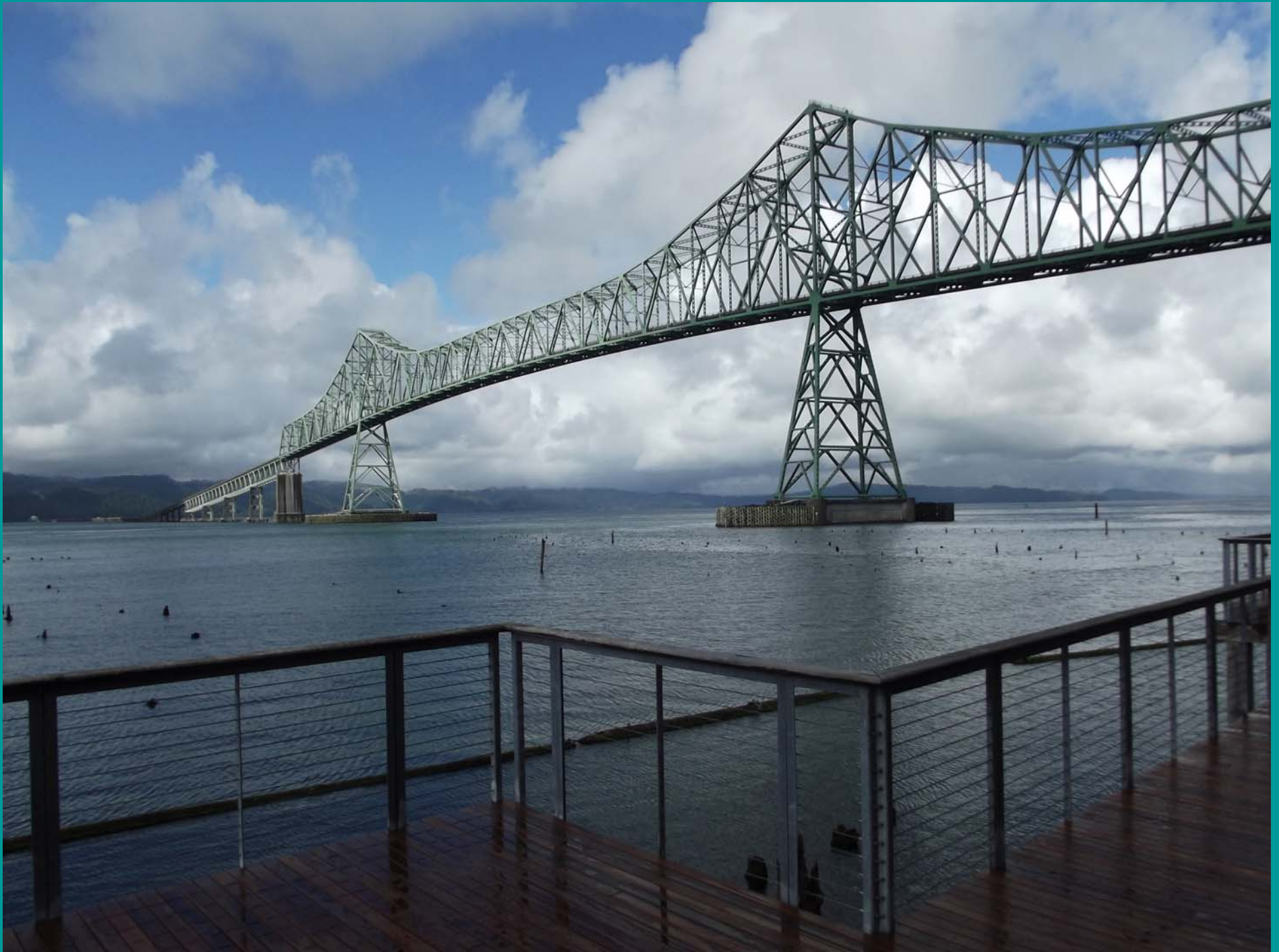
Bridge at Astoria