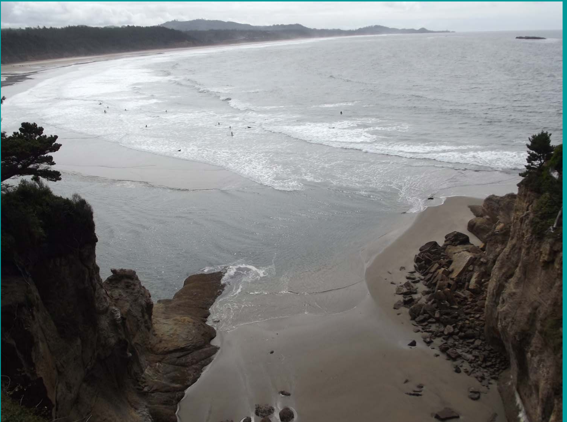
Surfers Near Otter Rock