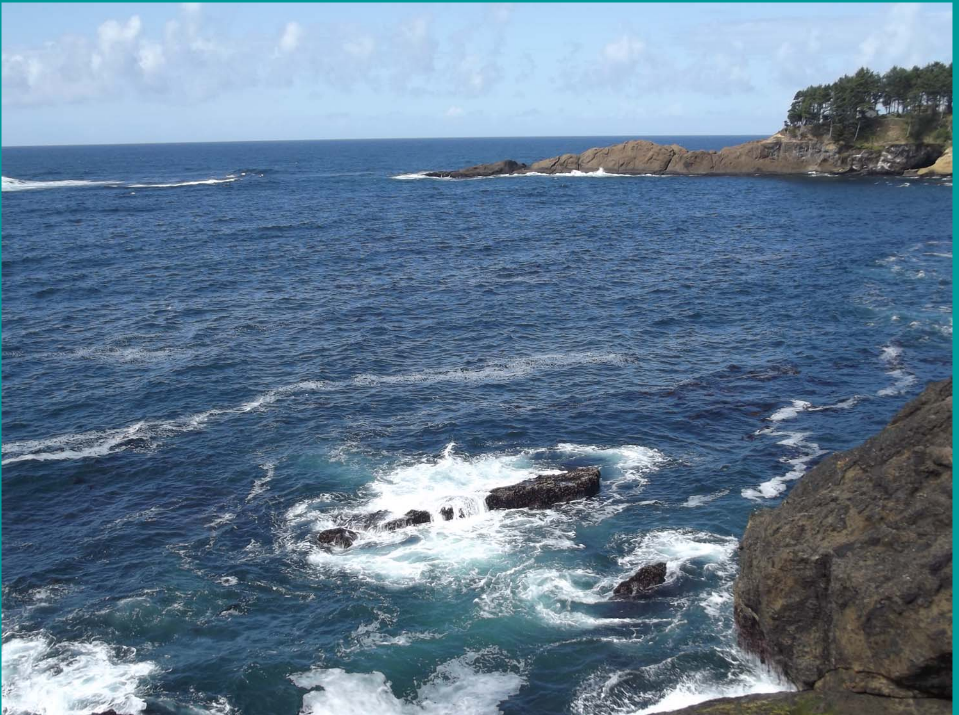
Surf at Depoe Bay