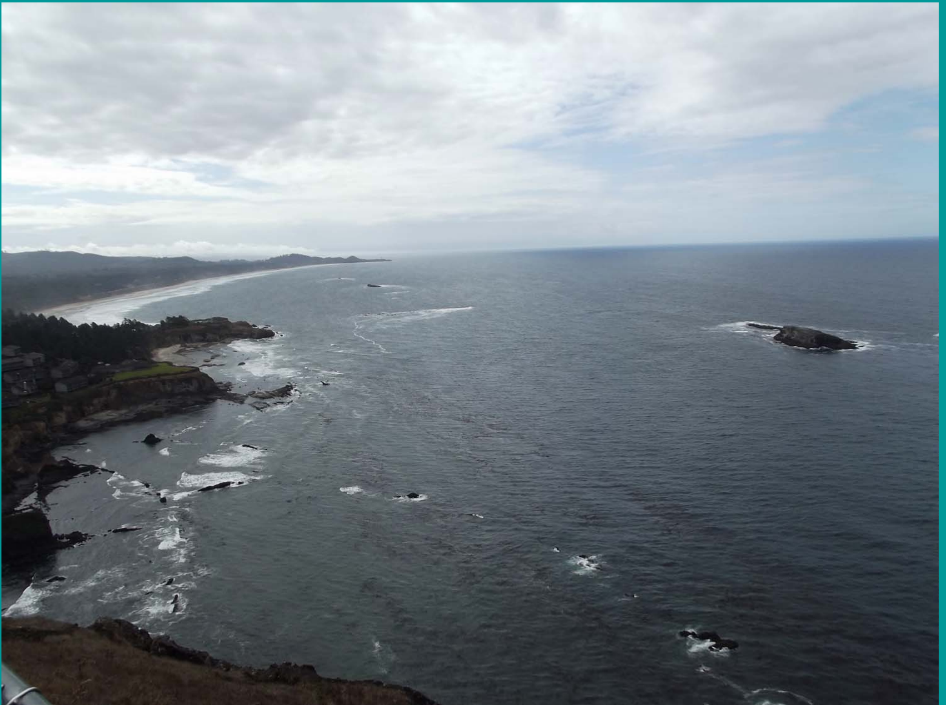
From Cape Foulweather (Gull Rock C Right)